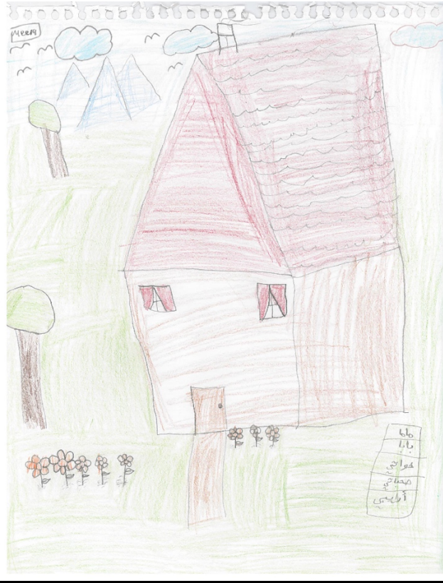
Source: A child participant during the individual interviews