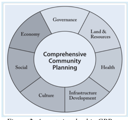
Figure 2. Aspects involved in CPP (AANDC, 2015).

The use of Comprehensive Community Planning (CPP) would be a beneficial way of conducting the relocation. This is because it uses a holistic process that allows communities to improve their sustainability, self-sufficiency and governance (AANDC, 2015). The holistic nature of CPP can be seen in Figure 2, as shown it is way of planning with consideration for all aspects of the community.