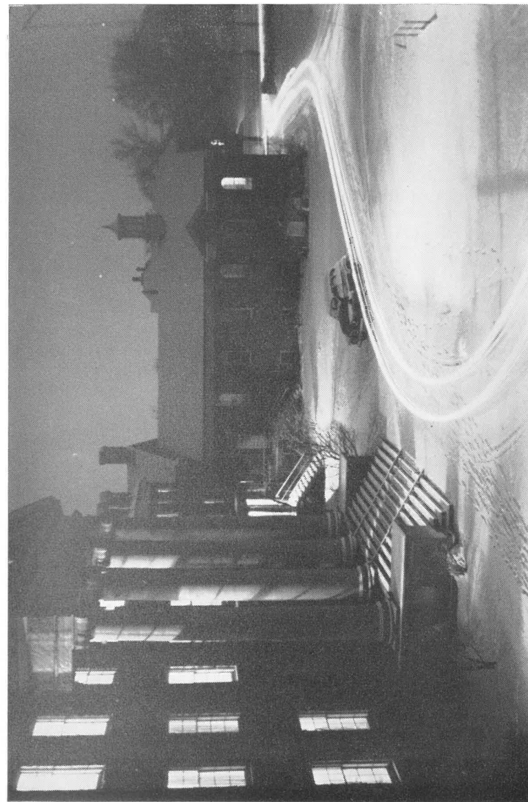
A WINTER NIGHT

In order that their class work may be recognized as qualifying for a degree or diploma, candidates must conform to the following requirements: