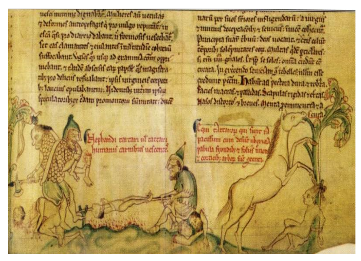
Fig. 2 A Tartar Cannibal Feast. Cambridge, Corpus Christi College MS. 16 fol. 166.