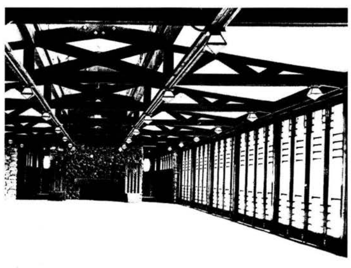
An interior view of the structure.

Parks Canada advise that demolition was necessary due to the extent of wood rot and foundation damage (this would seem to be a very valid argument in 1938, but one that would not satisfy heritage activists in 1984). Some colorful rumors persist in Banff and Calgary concerning accidental demolition of the Pavilion. Stories suggest that a mistaken demolition order was issued, or that a demolition crew mistook the object of their work one foggy morning in the meadow. One tale