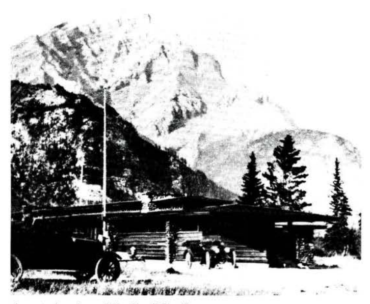
An exterior view of the Banff Pavilion.

used as a flop-house by railroad hitchhikers of the depression years. In any case the story ends with complete demolition of the building in 1938.