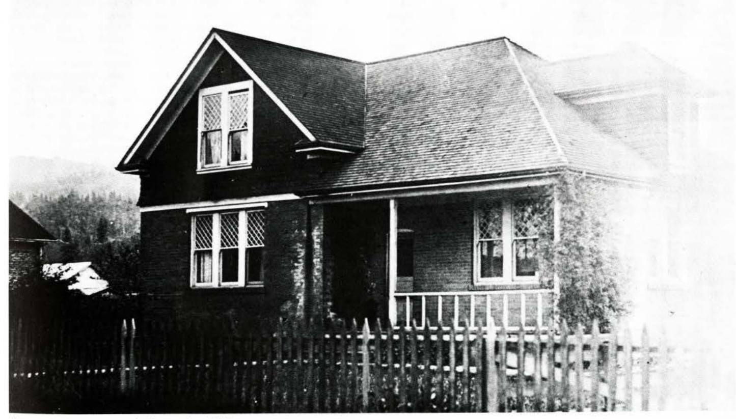
Figure 11. The Accountant's House, circa 1918.