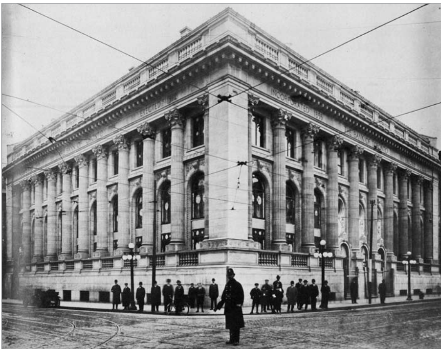
FIG. 1. BANK OF TORONTO CIRCA 1913, DESIGNED BY CARRERE AND HASTINGS.

In the first instance, it is important to recognize that architectural firms based outside of Toronto have been designing buildings here for a very long time. For example, the fine 1911 headquarters building for the Bank of Toronto, located on the south-west corner of King and Bay Streets (until its demolition in the 1960s for the creation of the Toronto-Dominion Centre), was designed by the well-known New York firm of Carrere and Hastings (fig. 1).