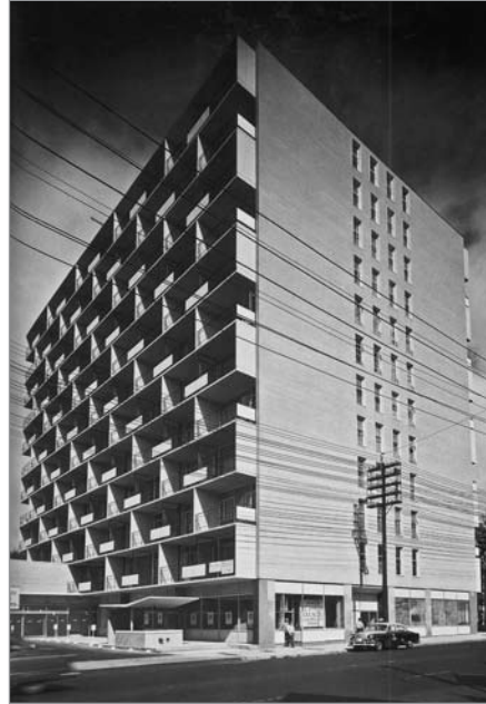
FIG. 3. THE 1957 ADDITION TO THE PARK PLAZA HOTEL (RECENTLY RENOVATED BEYOND RECOGNITION), DESIGNED BY PETER DICKINSON DURING THE PERIOD WHEN HE WAS THE DESIGN ARCHITECT AT THE FIRM OF PAGE & STEELE.