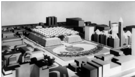
FIG. 4. DESIGN SUBMITTED TO THE 1958 INTERNATIONAL COMPETITION FOR THE DESIGN OF A NEW CITY HALL FOR TORONTO, BY JOHN ANDREWS AND MACY DUBOIS.