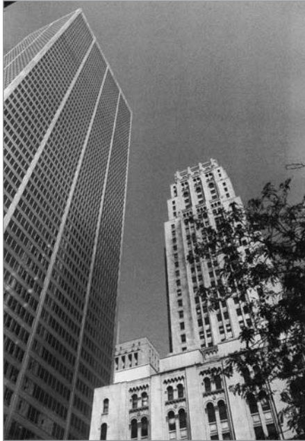
FIG. 2. THE CONTEMPORARY CANADIAN IMPERIAL BANK OF COMMERCE COMPLEX IN DOWNTOWN TORONTO, SHOWING TO THE RIGHT THE ORIGINAL HEADQUARTERS BUILDING OF THE CANADIAN BANK OF COMMERCE FROM 1929-1931, DESIGNED BY YORK & SAWYER FROM NEW YORK, WITH DARLING & PEARSON FROM TORONTO.