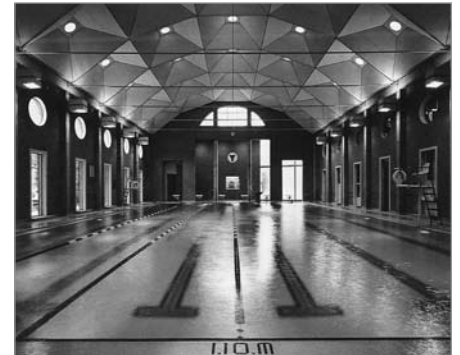
FIG. 8. THE DOWNTOWN TORONTO YMCA, 1985, DESIGNED BY A.J. DIAMOND. | IMAGE COURTESY OF DIAMOND & SCHMITT ARCHITECTS INTERNATIONAL.

The obvious difference between the "stars" enumerated in the first paragraph of this text, and the "imports" discussed subsequently, in regard to the evolution of architectural culture in Toronto, is that the "imports" in question became, over time, deeply embedded in that culture and, in turn, subsequently contributed deeply to it, in ways that the "stars" in question could not, and did not do. There are probably a handful of historical cases of architects "from away"—as the Newfoundlanders would put it—who have contributed to the evolution of a local architectural culture anywhere in the world—I think for example of Philip Johnson who, on account of an ongoing series of commissions for residences in Houston and Dallas (TX) in the 1950s and 1960s, seems to have engendered