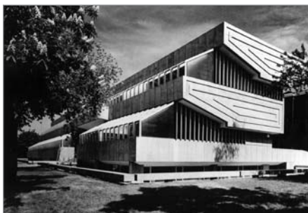
FIG. 6. STUDIO ADDITION TO CENTRAL TECHNICAL SCHOOL, TORONTO, BY MACY DUBOIS.