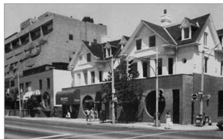
FIG. 7. YORK SQUARE SHOPPING COMPLEX, TORONTO, 1968, DESIGNED BY A.J. DIAMOND AND BARTON MYERS.

Similarly, the 1929 head office building of the Canadian Bank of Commerce (still standing today as Commerce Court East), just east of the south-east corner of the same intersection, was designed by the New York firm of York & Sawyer, in collaboration with the Toronto firm of Darling & Pearson (fig. 2).