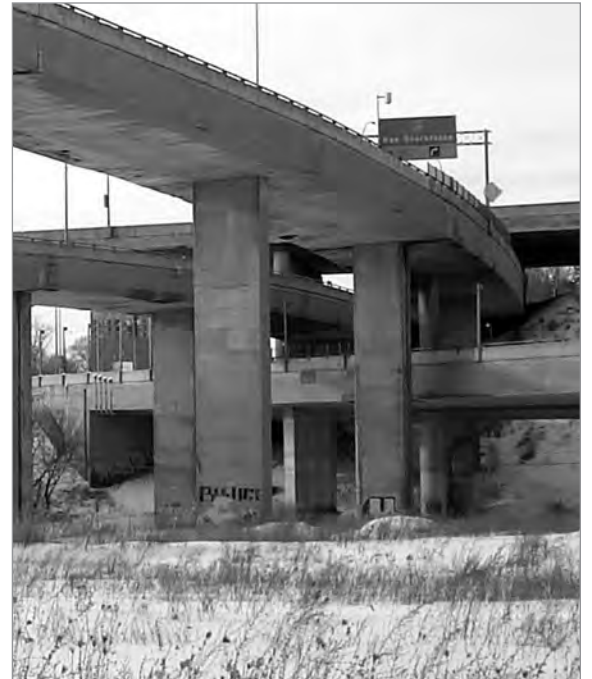
FIG. 8. TURCOT INTERCHANGE, 2009. | PIETER SUPKES.

The final idea is that of the articulation of two scales of movement in the city: the scale of the automobile and the scale of the pedestrian. 14 The ideas expressed were realized in the Central Area Circulation plan of 1961.