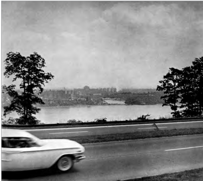
FIG. 5. THE CITY AS A VISUAL ENTITY. H.P.D. VAN GINKEL, 1962, "DESIGN WITH THE AUTOMOBILE: THE CITY," CANADIAN ART 77, VOL. XIX, NO. 1, P. 45. | JOHN REED.