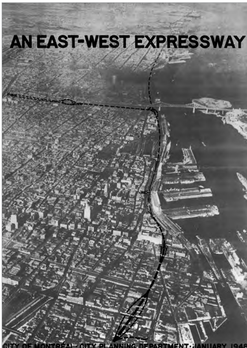
FIG. 1. NETWORK OF TRAFFIC WAYS. AN EAST-WEST EXPRESSWAY, MONTREAL, CITY OF MONTREAL PLANNING DEPARTMENT, 1948.

In postwar North America, the cross-town expressway was considered a tool to solve the mobility problems of dense intercity traffic. An example is the Montreal plan for an East-West Expressway of 1948 (fig. 1). Designed as a limited access route, the expressway was to function as a multipurpose traffic facilitator: for traffic decongestion in the downtown core, as a transportation network connecting the