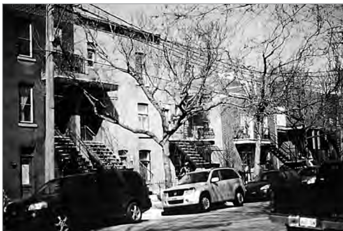
FIG. 9. CAZELAÏS STREET, THE TANNERY VILLAGE, 2009. | MARGARET E. HODGES.