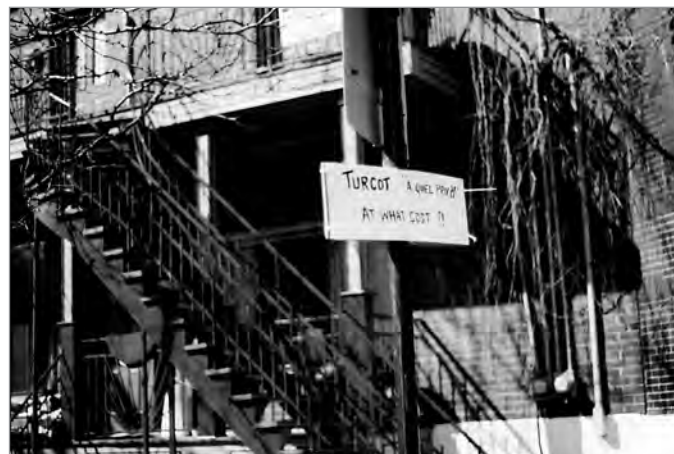
FIG. 10. PROTEST ON CAZELAÏS STREET, 2009. | MARGARET E. HODGES.

through the Canadian National (CN) right of way in the Turcot Yards and through Saint-Henri neighbourhoods (fig. 9). In addition, a second elevated expressway, the Bonaventure, was built along the remainder of the shoreline as a connection between the downtown and the Champlain Bridge, effectively cutting off the city from the waterfront. This foiled the van Ginkels' plans for a green waterfront development and the revitalization of Griffintown. 17