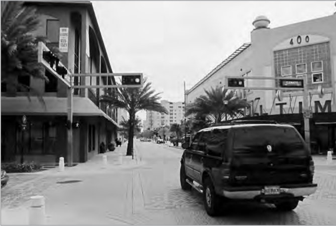
FIG. 11. DIXIE HIGHWAY (STATE HIGHWAY 805), WEST PALM BEACH, FLORIDA, 2010.