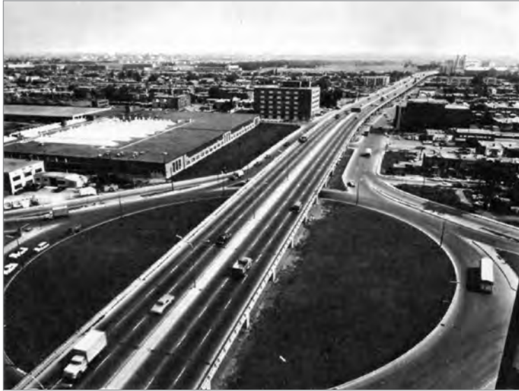
FIG. 2. METROPOLITAN BOULEVARD. URBAN TRANSPORTATION DEVELOPMENTS IN ELEVEN CANADIAN METROPOLITAN AREAS , OTTAWA, CANADIAN GOOD ROADS ASSOCIATION, 1968, P. 10.