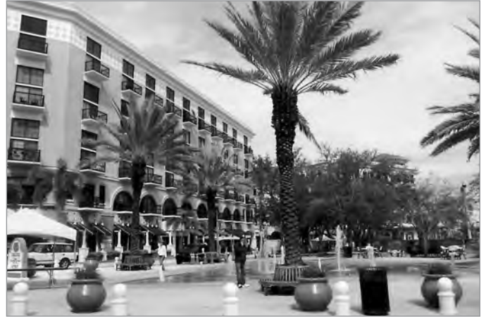
FIG. 12. CLEMATIS STREET CIRCLE, WEST PALM BEACH, FLORIDA, 2010. | MARGARET E. HODGES.

experiencing this sweeping view and high speed, one gradually descends onto the grade-level roads that run parallel to Turcot yards. Here the view is one of the ascension of the Angrignon Interchange that is also part of the proposed levelling process. It is here, when traffic joins in the grade-level stretch, that traffic becomes a problem at rush hour, due to the traffic stops at the Angrignon Interchange. On approaching the centre, the effect of the cantilevered westbound viaduct first hides, then reveals the view to the city centre. Suddenly the city centre landmarks come into view, which is an exciting experience if the traffic is moving at a rapid pace. Today, however, the aesthetic value of the expressway is often marred when the expressway cannot function at normal speeds due to the overburdening of vehicles. According to recent statistics, as many as two hundred and eighty thousand vehicles use the Turcot Interchange daily. 22 The expressway has become inefficient, unhealthy, and dangerous.