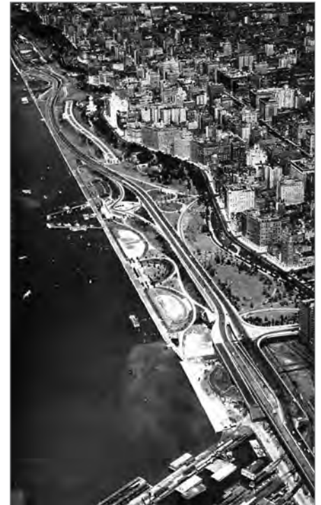
FIG. 4. WEST SIDE DEVELOPMENT INCLUDING HENRY HUDSON PARKWAY, 1934-1937.