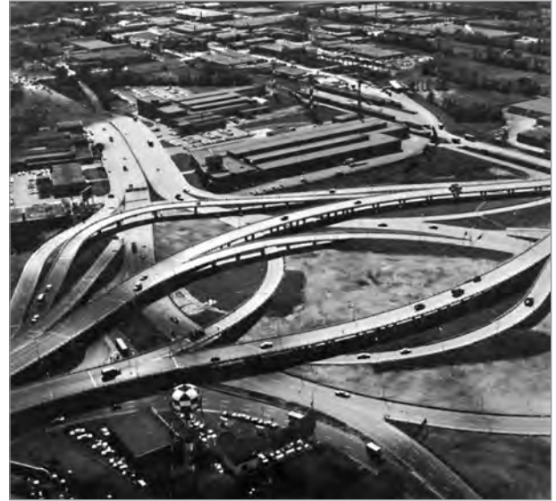
FIG. 3. METROPOLITAN BOULEVARD AT THE DÉCARIE INTERCHANGE. URBAN TRANSPORTATION DEVELOPMENTS IN ELEVEN CANADIAN METROPOLITAN AREAS , OTTAWA, CANADIAN GOOD ROADS ASSOCIATION, P. 10. | REPRODUCED WITH THE EXPRESS WRITTEN AUTHORIZATION OF THE TRANSPORTATION ASSOCIATION OF CANADA.

major sectors within the city, and as a city bypass route. For city planners, designing an urban expressway often meant choosing the path of least resistance by avoiding the dense core of the city and routing along the waterfront. 1 In the Montreal plan, a major advantage of a waterfront route was the non-interference factor. It was suggested that stable residential neighbourhoods, parks, playgrounds, churches, and shopping centres would not be affected by the new expressway. Although traffic relief was given top priority, other criteria included the possibility of shaping future development and importantly, eliminating blight in slum areas. The report stated: