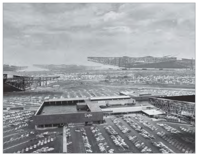
FIG. 6. RECENT THEORETICAL SPECULATION, SUCH AS "BATTLE OF THE MEGASTRUCTURES 1956," WHICH COMBINES VICTOR GRUEN'S SOUTHDALE CENTER AND CONSTANT'S NEW BABYLON, IS EVIDENCE OF THE RENEWED INTEREST IN MEGASTRUCTURE WITHIN INTERNATIONAL CONTEMPORARY ARCHITECTURAL DISCOURSE. | WAI ARCHITECTURE THINKTANK.