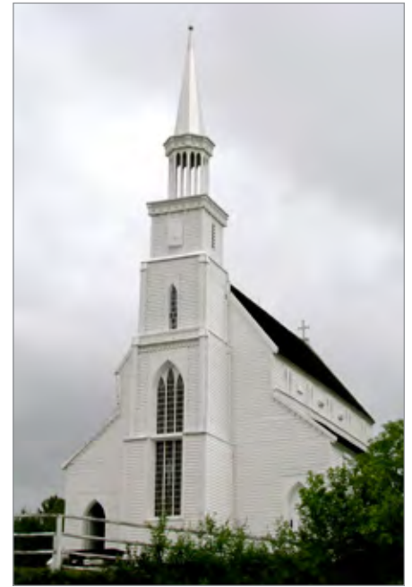
FIG. 22. WESTERN VIEW OF HOLY TRINITY ANGLICAN CHURCH, STANLEY MISSION (SK).

than the planned Anglican cathedral in Regina. In 1911, plans were begun for a fifteen-acre cathedral and college complex, which was to feature a "monumental" Collegiate Gothic style church that would rival the scale of the Saskatchewan Legislative Building (1908-1912) (fig. 19). 67 The plans were so ambitious that the cathedral was never able to make it past the planning stage and Bishop Malcolm Harding vowed that the diocese would never again be "diverted by any other [such] scheme." 68 The most ambitious church actually constructed is St. Andrew's Presbyterian Church in Moose Jaw (1912) (figs. 20-21). The one-thousand-four-hundred-seat church was constructed well beyond the means and needs of the congregation of nine hundred and nine members. The Late Gothic Revival Tyndall limestone church was constructed to such a level of lavishness that the debt for the construction was