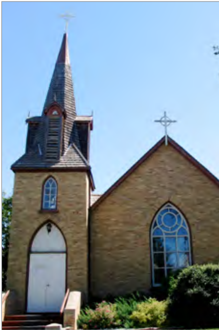
FIG. 17. WESTERN VIEW OF ST. PETER'S ANGLICAN CHURCH, QU'APPELLE (SK), 1885, WILLIAM HENDERSON, ARCHITECT.