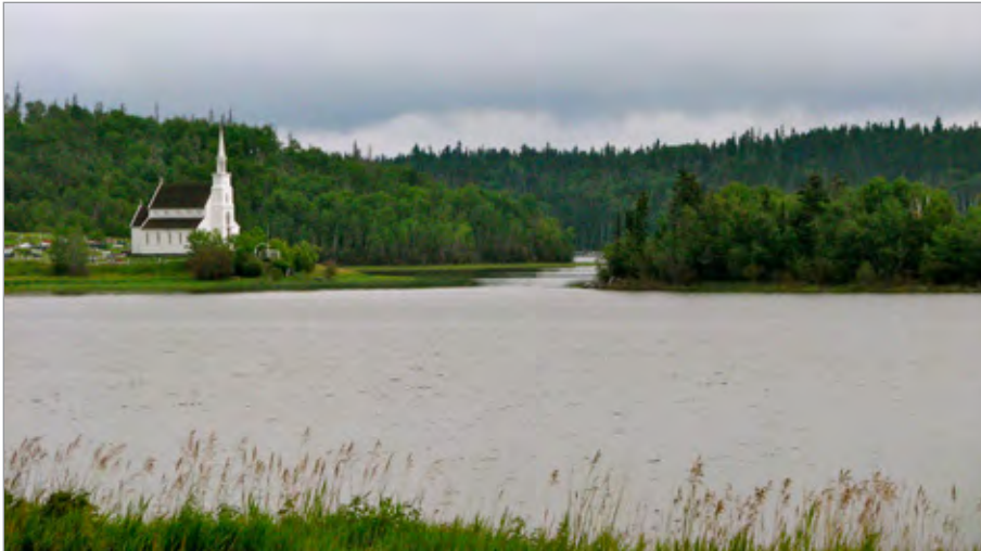
FIG. 3. VIEW OF THE LANDSCAPE SURROUNDING HOLY TRINITY ANGLICAN CHURCH, STANLEY MISSION (SK).