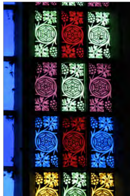
FIG. 12. CLOSE-UP OF GEOMETRIC STAMPED STAINED GLASS, HOLY TRINITY ANGLICAN CHURCH, STANLEY MISSION (SK).

church itself. The first feature of note is the aforementioned general massiveness of the church, which has no local precedent. While this was a common feature in many High Victorian churches, it was mostly the result of looking to loftier European (often French) Gothic structures for inspiration. 35 However, Anglicans tended to favour English examples and principles for their churches due to a perceived connection between the Gothic style and the “history of the English Church or nation.” 36 As there were very few exemplars of large English “ancient” (Gothic) wooden churches in England, it is likely the church builder(s) looked to the publications of the CCS for acceptable alternatives. Beginning around the 1840s, discussion surrounding acceptable medieval models of wooden churches was frequent in the architectural publications of the day in response to requests from places like Newfoundland, where wood was the preferred material. The most