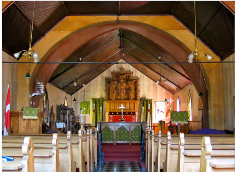
FIG. 18. SOUTHWESTERN VIEW OF ST. PETER'S ANGLICAN CHURCH, QU'APPELLE (SK).

of the rival NWC, Alexander Mackenzie, “eyed these ‘missionaries’ with distaste,” believing that “nothing but trouble and pain would result from their intrusion into this unspoiled country” and that they would “ruin [his] Indians.” 48 The Roman Catholics seemed to be able to weather this hostility (or ambivalence in the best situations) without much difficulty. The Anglicans by contrast were greatly hampered without support from a strongly established HBC. At Île-à-la-Crosse, the lack of support resulted in essentially little to no Anglican presence at this major trading post settlement, in contrast to the thriving Roman Catholic mission. Given the competitive history between these two denominations, the complete failure to establish a successful mission at such a prominent settlement no doubt spurred a heightened sense of rivalry and a desire to succeed. This increased sense of competition helps explain the motivation behind wanting to construct an impressive and