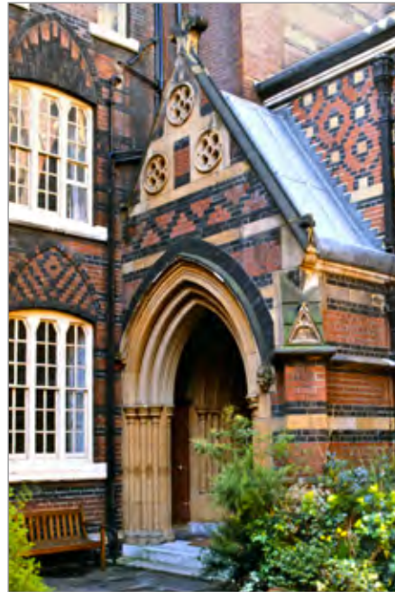
FIG. 14. CLOSE-UP IMAGE OF ALL SAINTS MARGARET STREET ANGLICAN CHURCH SHOWING CONSTRUCTIONAL POLYCHROMY LOZENGE AND ZIGZAG PATTERNS. | MALCOLM THURLBY.

Gothic models, the likelihood that the CCS's recommendation was considered is rather high. Therefore, the CCS was probably one of the contributors to the design of the church, albeit indirectly.