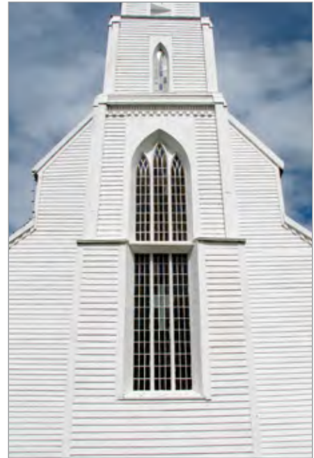
FIG. 16. CLOSE-UP IMAGE OF THE WESTERN TOWER WINDOW OF HOLY TRINITY ANGLICAN CHURCH.

An analysis of the general features of the church suggests that the structure is anomalous. The reasons for this unusual nature cannot be fully gleaned from looking at the church on its own. Rather, an examination of the experience of other mission churches in the region is necessary to determine why the church was constructed in such a way. The major trading posts of the era were located along the Churchill River as it was "one of the great trade routes across the continent to the northwest." 44 The general state of success of Anglican missions was very poor in contrast to Roman Catholic missions at these major posts. The Anglicans were generally much slower at making forays into the region than the Roman Catholics because of their reluctance to forge forward without the support of the HBC. 45