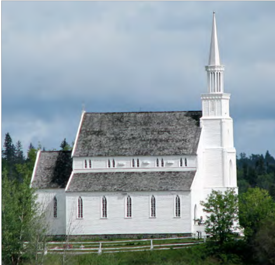
FIG. 2. SOUTHERN SIDE OF HOLY TRINITY ANGLICAN CHURCH, STANLEY MISSION (SK), 1854-1860, ARCHITECT UNKNOWN.

a (supposed) monopoly over the fur trade in Rupert's Land in 1670 (the region now encompassing Alberta, Saskatchewan, Manitoba, and much of the Northwest Territories). 2 The fur trade provided the potential for profit, but was not without its challenges. Chief among these was isolation; most settlements had only rudimentary services and were few and far between. During the long harsh Prairie winters, this isolation often had fatal consequences. The stories shared by immigrants with those back in England often held accounts of children starving and of finding families huddled in the snow. 3 Another major challenge was the difficulty of obtaining resources. Acquiring enough building materials to construct a serviceable shelter from the elements