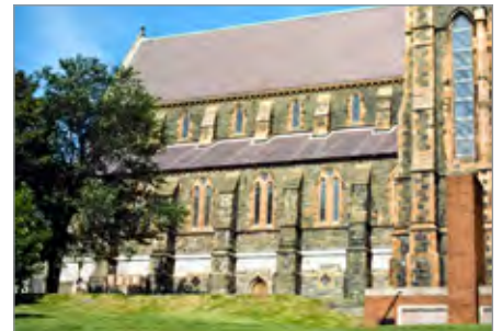
FIG. 6. ST. JOHN'S ANGLICAN CATHEDRAL, ST. JOHN'S (NF) 1847-1850, ARCHITECT GEORGE GILBERT SCOTT.

Île-à-la-Crosse (also constructed in 1860), for instance, was a modest rectangular structure that was the same size as the small vernacular buildings surrounding it (fig. 4). 10 The other important church in the region, St. Joseph's Roman Catholic Church at Cumberland House (1870) (fig. 5), was a "small log house" only 6.7 square metres in size, a fraction of Holy Trinity's size. 11 The only comparable churches are found in eastern Canada in cathedral churches such as George Gilbert Scott's St. John's Anglican Cathedral in Newfoundland (1847-1850), with a width of 18.3 metres, a general height of 17.4 metres and a roof ridge height of 24.4 metres (fig. 6). 12 Since height was one of the features advocated to separate a simple country church from a more elaborate "town church" in