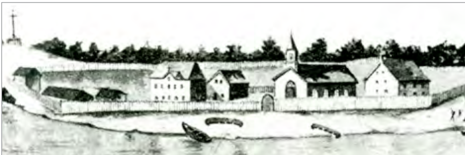
FIG. 4. SKETCH OF CHÂTEAU SAINT-JEAN, ÎLE-À-LA-CROSSE (SK), 1860, BUILDER UNKNOWN. | VYÉ BOUVIER, 1860, RA-24431, SAB.