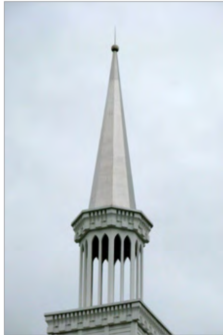
FIG. 15. CLOSE-UP IMAGE OF THE SPIRE OF HOLY TRINITY ANGLICAN CHURCH SHOWING DELICATE FEATURES AND DENTIL RANGE.

was the product of many different interests (namely, Reverend Hunt's, Bishop Anderson's, the CMS's, and the CCS's).