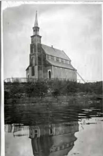
FIG. 13. NORTHWEST VIEW OF HOLY TRINITY ANGLICAN CHURCH SHOWING RED AND YELLOW PAINT REMNANTS, STANLEY MISSION (SK). | CHRISTINA BATEMAN, 1919, SB-581, SAB.