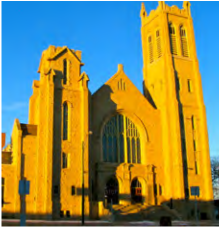
FIG. 20. WESTERN VIEW OF ST. ANDREW'S PRESBYTERIAN/UNITED CHURCH, MOOSE JAW (SK), 1912, JOHN H.G. RUSSELL, ARCHITECT. | KRISTIE DUBÉ.

was rarely used (not even the newly constructed Government House in Battleford, 1876-1878, used brick). During the pioneer period, apart from the building material, even the most lavish structures (constructed some twenty-five years later) were generally simplistic in design and far removed from the majesty of Holy Trinity.