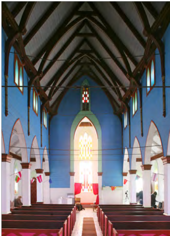
FIG. 7. INTERIOR VIEW OF HOLY TRINITY ANGLICAN CHURCH FACING WEST, STANLEY MISSION (SK). | MALCOLM THURLBY.