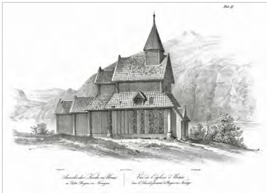
FIG. 11. LITHOGRAPH BY J.C. DAHL (1837) OF URNES STAVE CHURCH, NORWAY, C. 1150.