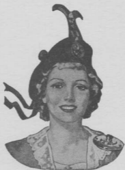
THE MACDONALD LASSIE