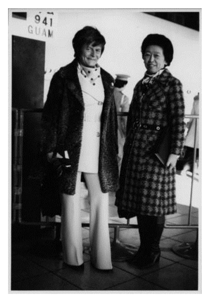
Photograph of Elisabeth Mann Borgese and a woman in Japan, MS-2-744, Box 169, Folder 30, Item 2