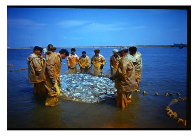
Photo negative of fisherman in Volga River , MS-2-744, Box 178, Folder 20, Item 6