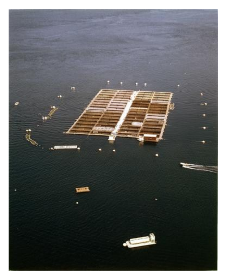
Photograph of a fish farm, MS-2-744, Box 178, Folder 5, Item 3