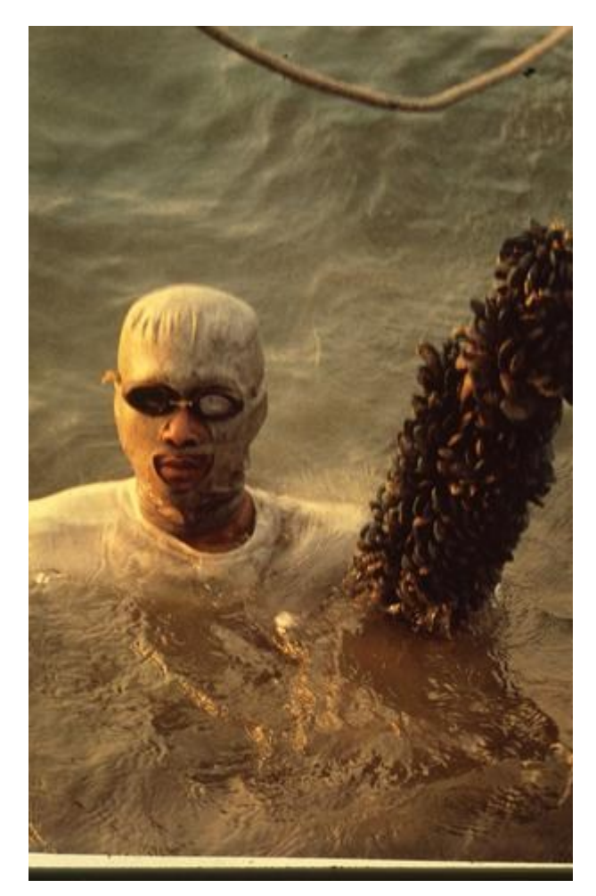
Slide depicting mussel farming, MS-2-744, Box 371, Folder 5, Item 126