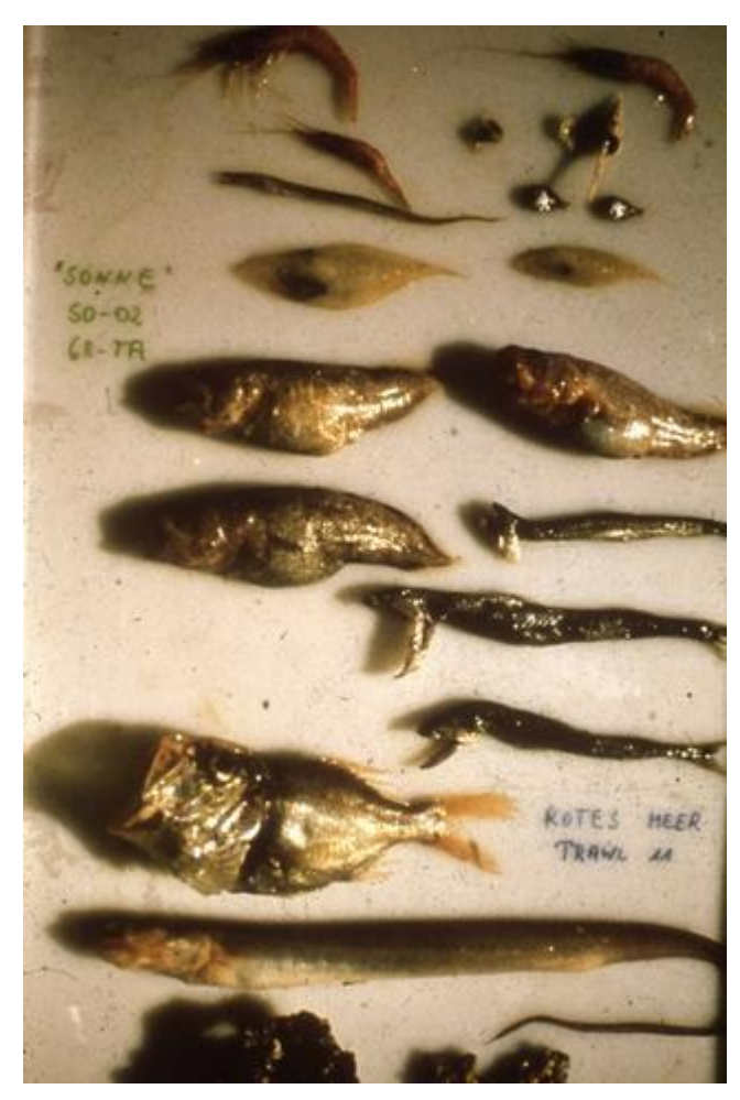
Slide depicting sea life, deceased, MS-2-744, Box 371, Folder 5, Item 143