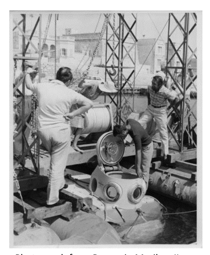
Photograph from Pacem in Maribus II, MS-2-744, Box 169, Folder 28, Item 13