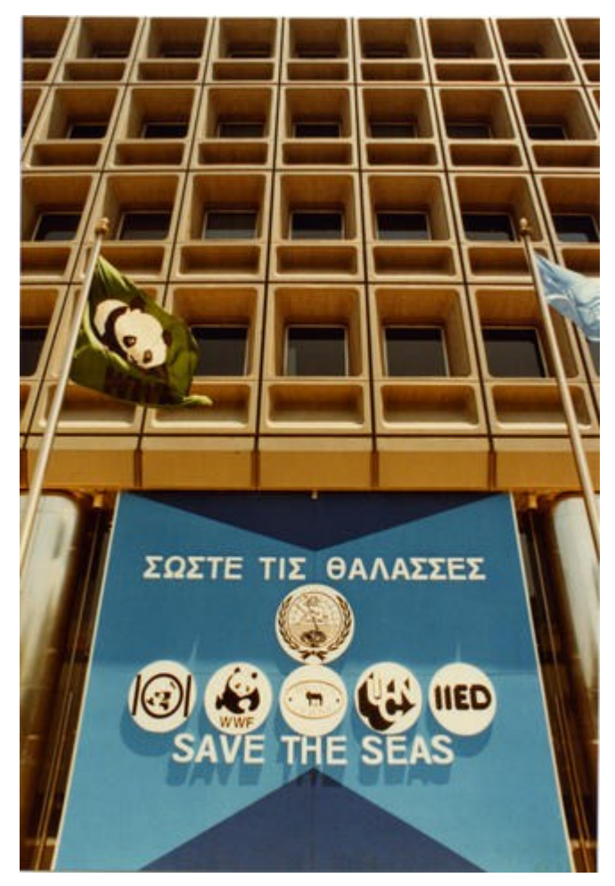
Photograph from a Hellenic Marine Environment Protection Association (HELMEPA) event, MS-2-744, Box 237, Folder 53, Item 27