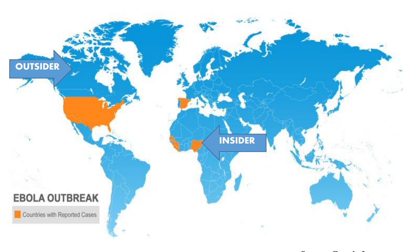
Figure 2: Map of Ebola Outbreak (October 2014)