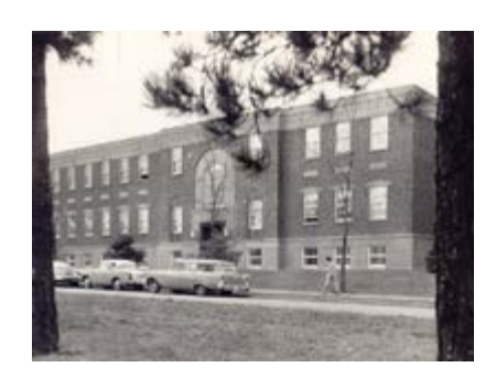
Dental Building, Dalhousie University, Forrest Campus, n.d.