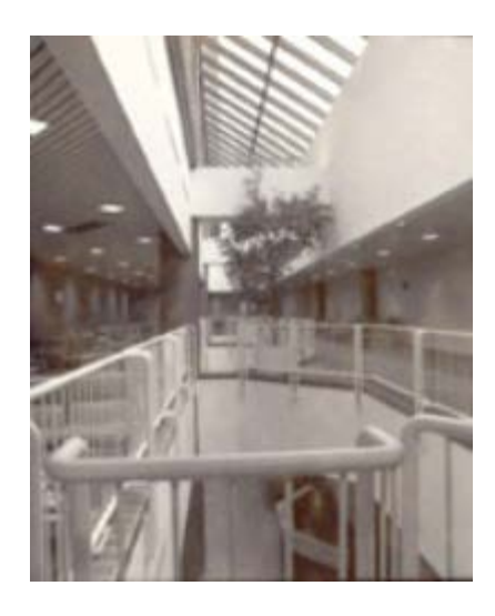
Dentistry Building - Interior - Upper Floor [1], c1980s