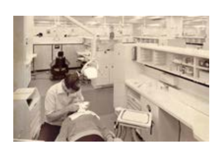
Dental Clinic, September 29, 1980