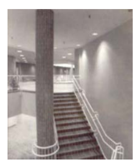
Dentistry Building - Interior - Staircase and Pillar, c1980s