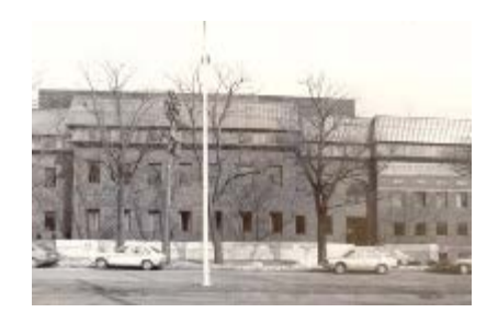
Dentistry Building - Exterior - Front View, n.d.