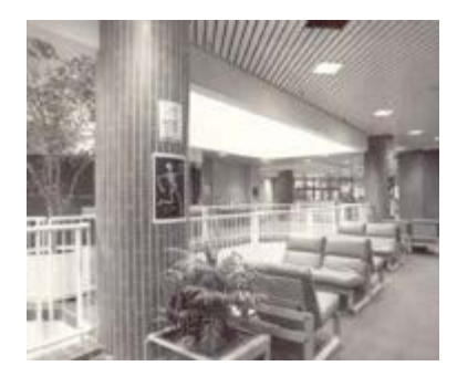
Dentistry Building - Interior - Upper Floor - Seating Area, c1980s