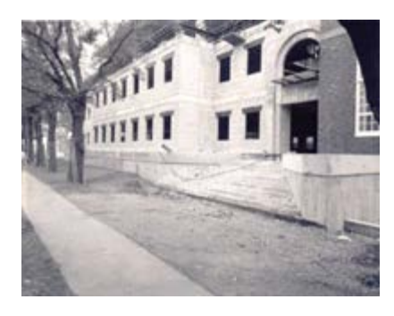
Dental Building (under construction),