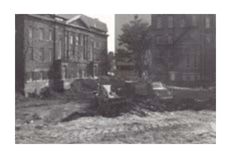
Dentistry construction begins, n.d.