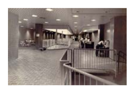
New Dental Building - Interior - Upper Level, September 29, 1980