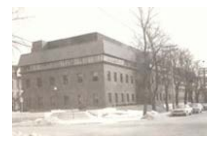
Dentistry Building - Exterior - View from Robie Street, c1980s