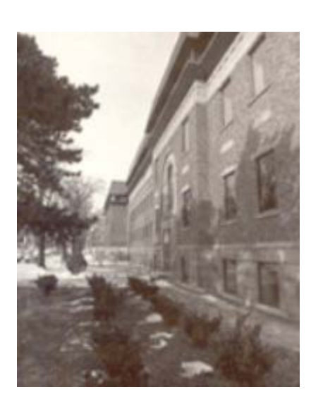
Dentistry Building - Exterior - Side View (Close-up), c1980s