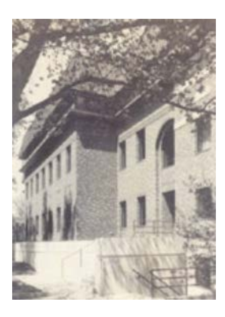
The newly modernized and expanded Dentistry building will be officially opened on June 18, June 1982