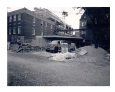
Dentistry Building Extension - Construction, October 9, 1979