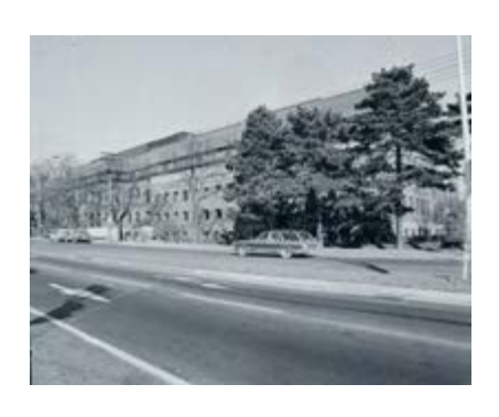
Dentistry Building, November 1981