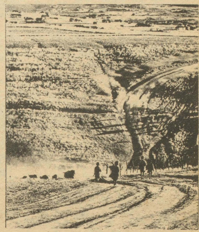
Distant view of a Zulu bantustan, South Africa.

Now under the auspices of the Transkei Development Corporation in Umtata, there is little to suggest that the 'republic' will differ from BICs in anything but the address