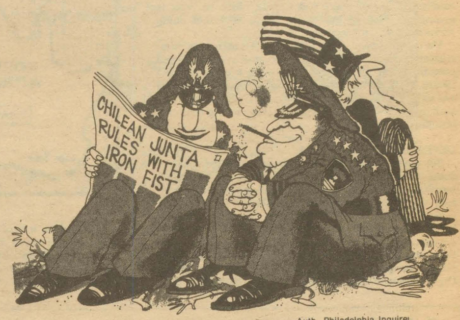
Auth, Philadelphia Inquirer

"We urge people, to express their concern by pressuring the banks involved as well as our government. If all nations refuse to deal with the facist dictatorship if will help the Chilean people's struggle for human rights".