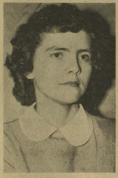
KAY LEWIS Law