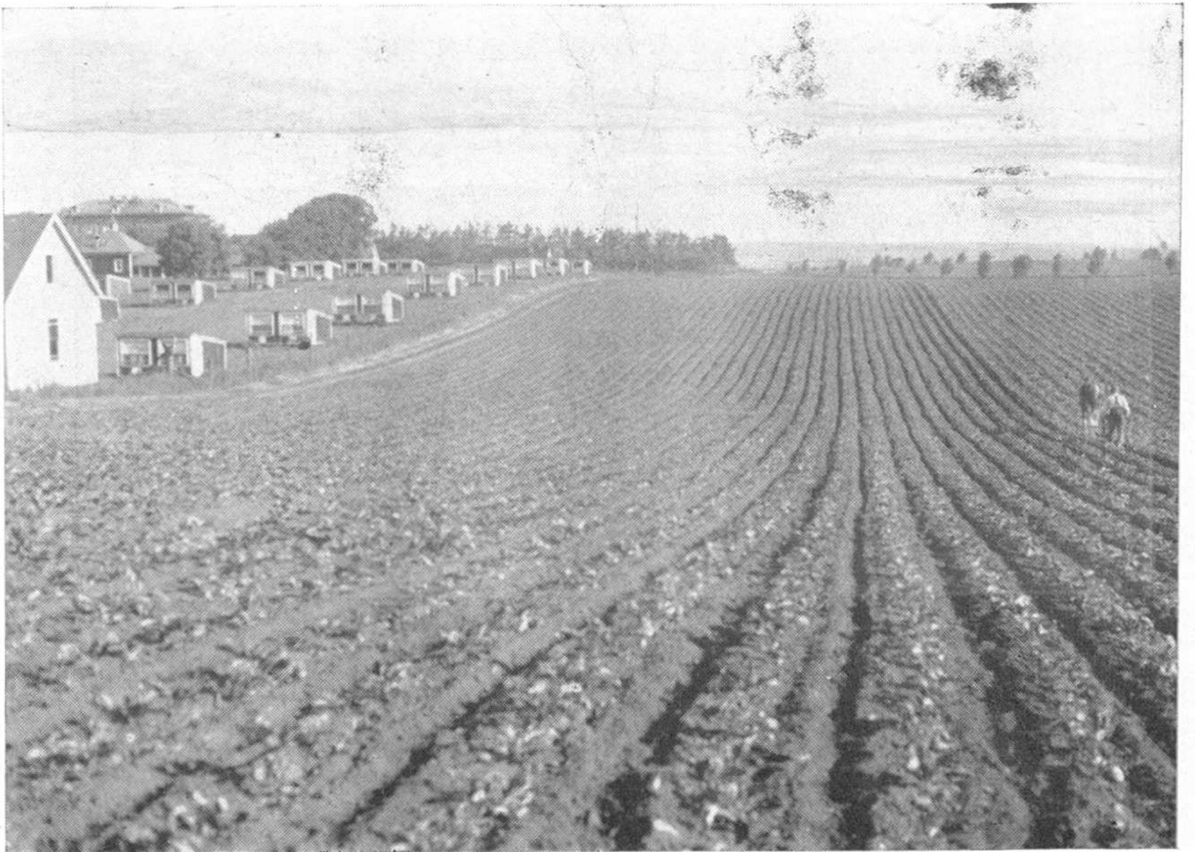
College farm scene.