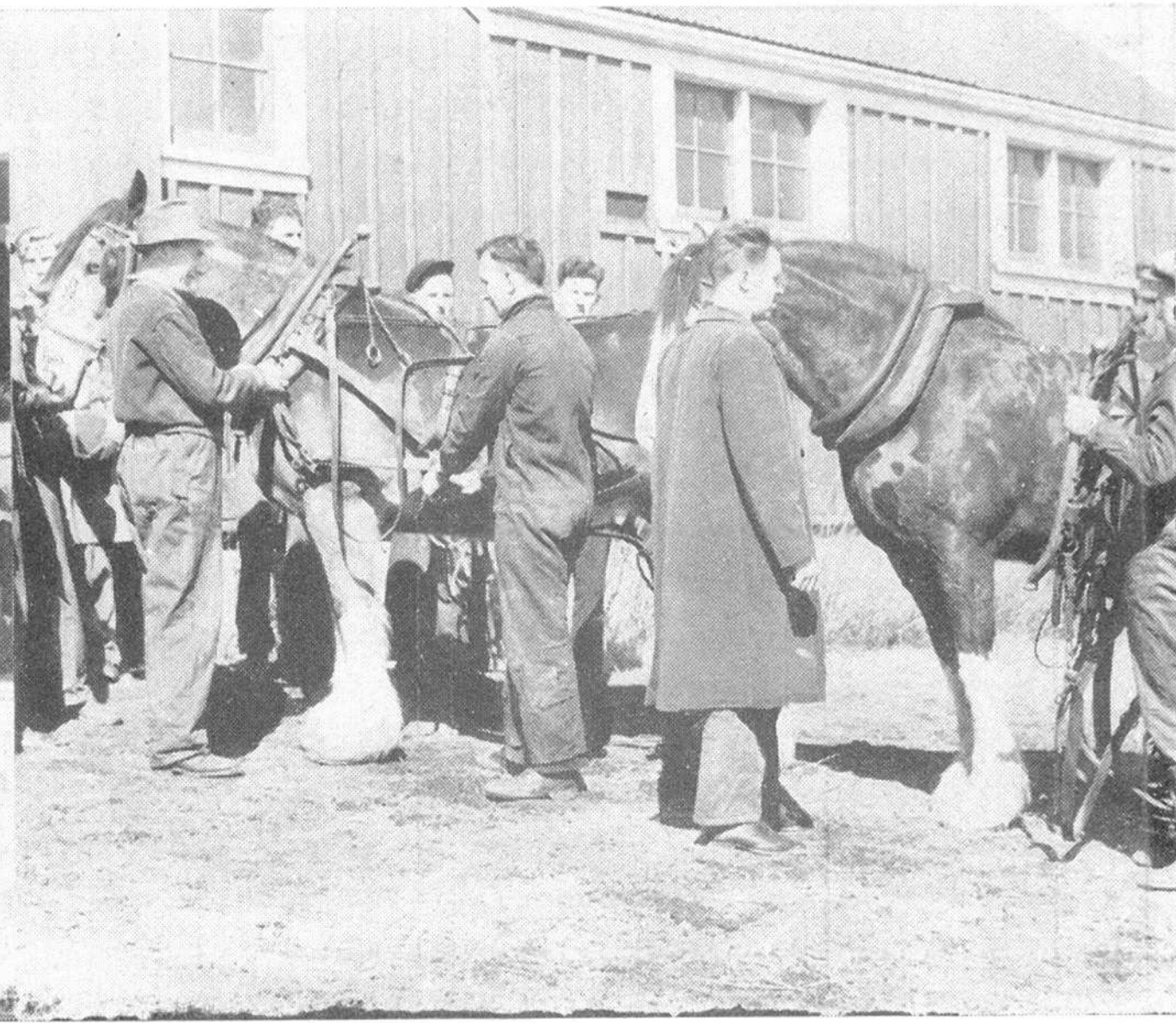
Lesson in harness adjusting