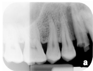
Figure 3. Fading of image where light exposure occurred

Mirrored imaging of PSPs exposed to radiographs on non-sensitive side. In our study, there was only one occurrence of backward placement of the PSP in the bite block of the Rinn holder and, therefore, exposure to the non-sensitive side of the receptor. While this number appeared insignificant, the consequence of such an error is significant because it could lead to incorrect mounting of a digital image