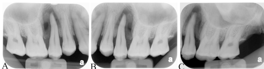
Figure 4. Image A is a mirrored image of B due to exposure of non-sensitive side of PSP

Evidence of improper handling of PSP plates. PSP plates can be scratched if they are not handled correctly. Scratches were found in the images of three separate PSPs. Studies have indicated