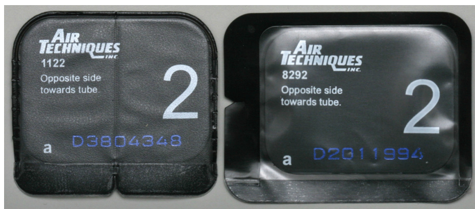
Figure 2. Comparison of disposable barrier to new barrier with minimal edge design

In addition, the study identified the problem of PSP plate shifting particularly in the anterior region. The shifting of the PSPs led to placement errors in which the teeth of interest were not centered in the image. These errors were recognized as being different from regular off-centered placement errors because, in the case of shifting, the tooth being centered in the view was clearly biting on the center of the bite-block, but the plate had shifted sideways in the bite-block causing the tooth to be off center in the image. This problem stemmed less from op-