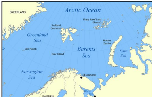
Figure 2: The Barents Sea.

The Barents Sea Integrated Management Plan was updated in 2012 due to the expansion of knowledge about the ecosystem, ecological goods and services and other resources that provide economic value. The most important changes that were identified included affects of the environment with climate change, benthic communities, Sea birds, effects of seismic activities and mapping of petroleum resources. The updated goals and objectives within the new plan aim to address these issues.