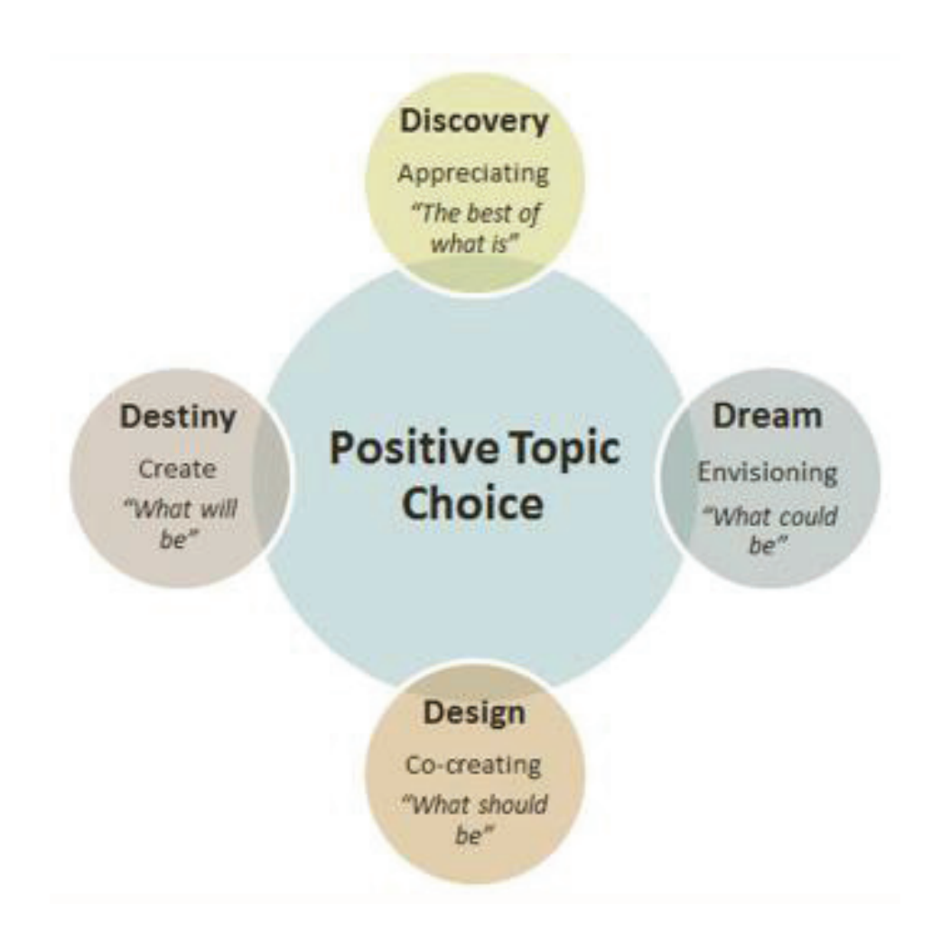
Appendix A 4-D Cycle