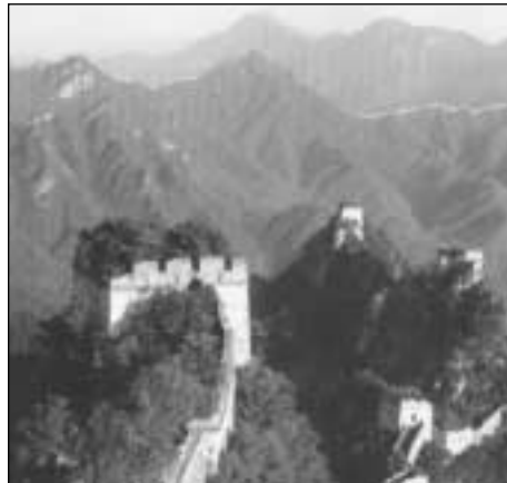
The Great Wall – not the part I climbed but I camped in a similar square tower.

This is the question I am faced with as I meet various people who know I have just returned from China. The answer to that question is a hard one to form. How can you explain six months in a foreign country with experiences that have assaulted every one of your senses? Awesome, amazing, fantastic, unbelievable....a few words that I have used but certainly they do