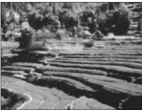
Terraced rice fields

This is the question I am faced with as I meet various people who know I have just returned from China. The answer to that question is a hard one to form. How can you explain six months in a foreign country with experiences that have assaulted every one of your senses? Awesome, amazing, fantastic, unbelievable....a few words that I have used but certainly they do