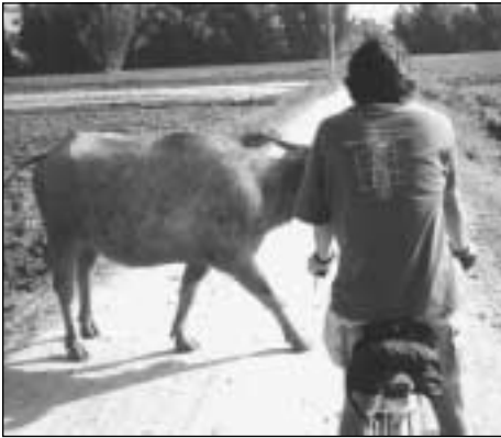
Caution, water buffalo crossing!

ing and exciting car ride that anyone could go on. The whole time we were driving, I could not figure out any rules of the road. When I asked my travelling companions about the rules of the road, they told me that there was basically only one rule: pay attention to what's in front of you and do not worry about what is beside you or behind you.