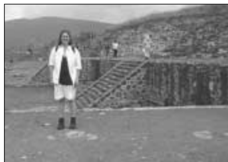
In front of the pyramids at Teotihuacan, Mexico.

snarled traffic, the uneasy social mix of rurality and urbanity (different lifestyles, attitudes) and pollution. Surrounding the city, divided by the highway, are large fields in which maize is the principal crop. The educational institutions in the municipality, but not the city, of Texcoco, are also focused primarily on agriculture, but that is changing. The Colegio de Postgraduados, where my research partners are based, is a strictly graduate institution, awarding degrees in rural development, forestry and agricultural sciences. As a separate institution it is about 40 years old. It is connected to the state in a somewhat complex relationship,