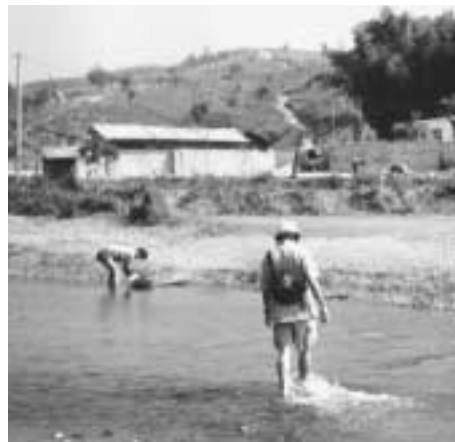
Crossing the Chinese/Burmese border. Note the fellow doing his laundry upstream.

I also managed to get some travelling in during my stay in China. I made it to Beijing for a week in October over the National Holiday. I got to see the Forbidden City, where the movie The Last Emperor was filmed, the Summer Palace, a few Buddhist temples, but the most impressive was the Great Wall. I was travelling with three other friends from Fuzhou and we decided to head up to the Wall on an afternoon and camp out over night and continue to climb it the next day. We went to a section that has not yet been developed for tourism and was three bus rides away from Beijing. It took us longer to get there than planned and we had to buy flashlights in