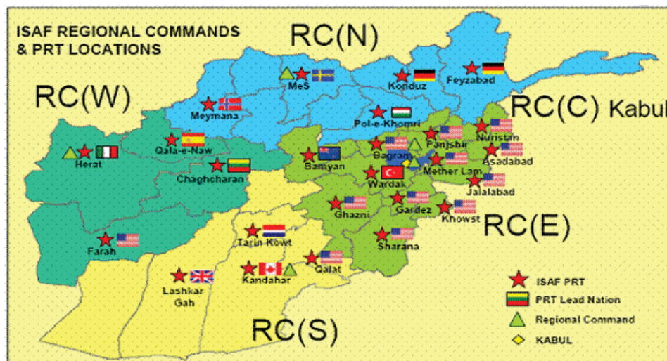
Figure 9-2 NATO ISAF PRT Locations Afghanistan 118