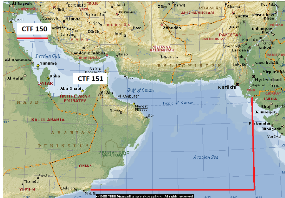
Figure 8-1 Chart of CTF 150 and CTF 151 Areas of Responsibility

assigned a USN vessel to conduct the boarding.