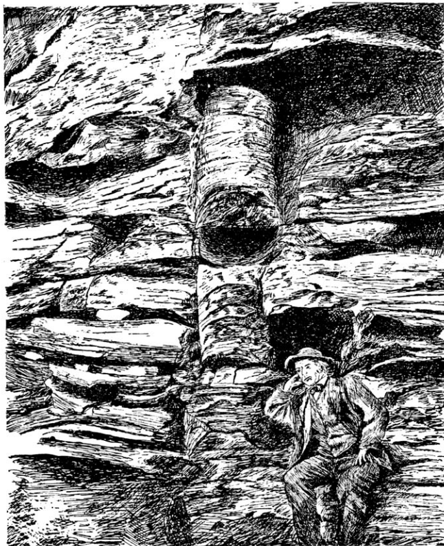
TREE-LIKE CONCRETIONS AT KINGSTON, ONT.