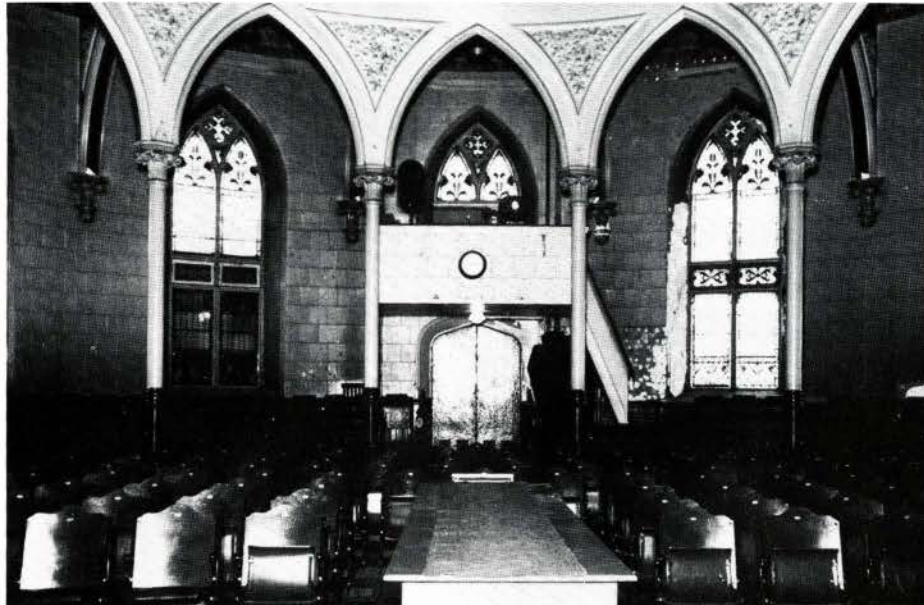
Interior of Auditorium/Theatre, Toronto Normal and Model Schools circa late 1950's prior to its demolition in 1963.

"The whole (building) has been designed with a view rather to utility than to effect, care being taken, however, to maintain that fitness of decoration by which the purpose and importance of the institution may be characterized and upheld," so declared Egerton Ryerson, 2 July 1851, when he laid the corner-stone for the Toronto Normal and Model Schools buildings. Earlier in 1845, Ryerson had introduced the concept of tax-funded public education to Upper Canada after his many trips to similiar European institutions. Schools at the turn of the century were rarities. Even if a privileged family was able to afford the fees, the child could not be guaranteed of a good education. Teachers were of poor calibre being either uncommitted or ill-trained. The Normal School was set up to train teachers, and the Model School was sometimes used for practice teaching. The original Normal and Model Schools opened in November 1847 and did not find a permanent home until five years later in the product of Frederick Cumberland's architectural genius. The building was meant to be a showpiece of Upper Canada's school system.