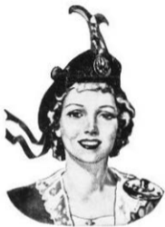
THE MACDONALD LASSIE