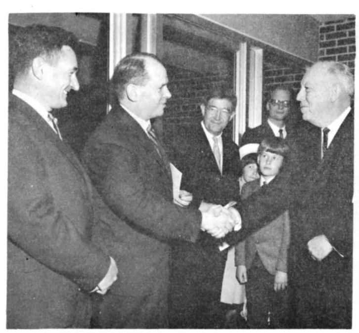
AT THE OPENING OF EATON HOUSE, RESIDENCE FOR MEN, ACADIA UNIVERSITY, 1966