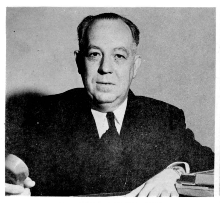
BEHIND THE GREAT DESK Dictaphone at the ready