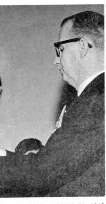
ENT HOUSE, HALIFAX, 1959. Plow on behalf of the Order John Ambulance).