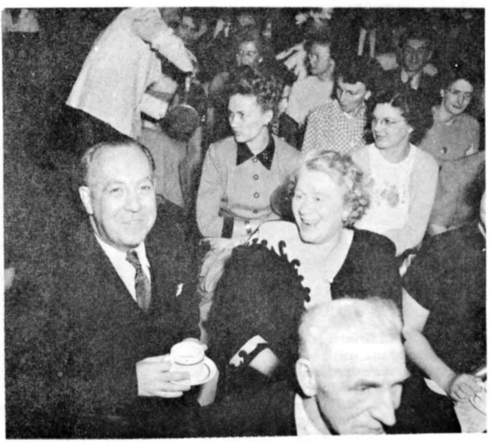
AT THE 1950 SANATORIUM HALLOWE'EN PARTY