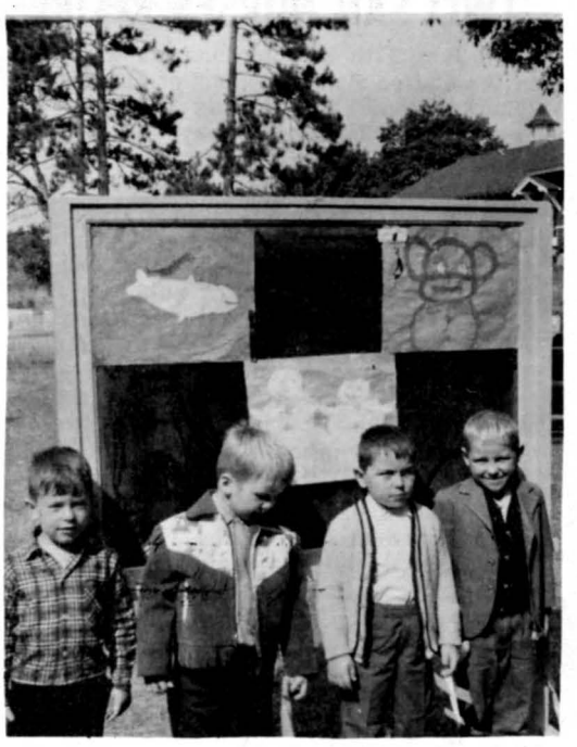
Young artists, 1968 Children's Art Exhibition

Bride — I'm very bugged at recipes in cookbooks that simply tell you to add two eggs. They never say if they should be boiled or fried.