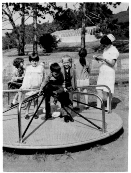
Playtime at the Sanatorium, Summer 1968