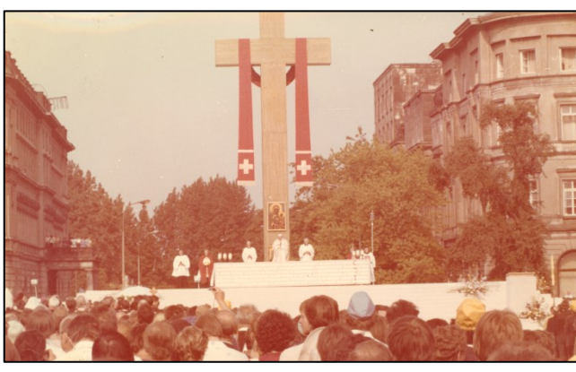
Figure 3.1. In his first Mass in Poland as Pope, John Paul II stood in front of a large cross, draped in a red-and-white fabric with a copy of the Black Madonna of Częstochowa, one of the most venerated symbols of Polish Catholicism, attached to its base.

numerous reasons. For one, it was the first official visit of the Papacy to a communist state,