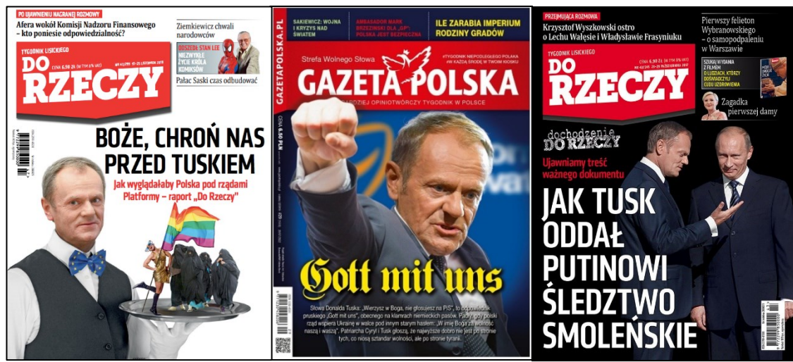
Figure 6.2. Donald Tusk has been portrayed by PiS-affiliated and right-wing media a variety of ways to undermine Tusk's own connection to Poland and the Polishness of his supporters and other pro-European Poles. These depictions range from a cosmopolitan European eroding Polish identity and culture through LGBT+ acceptance and non-Christian immigration ("God, save us from Tusk!"), emphasizing his German heritage, and more recently framing the former Prime Minister as pro-Russian or close to the Putin regime ("How Tusk handed over the Smolensk investigation to Putin").

In light of the events in Ukraine, PiS has, as of this writing, passed a new law in June 2023 aimed at countering perceived Russian influence by allowing a commission selected by the government to investigate individual politicians for any connections to Russia that may be deemed undemocratic and a threat to state security. 174 The commission's direct connection to the government has been criticized for giving PiS the legal power to investigate and (in the original draft of the act, before being removed due