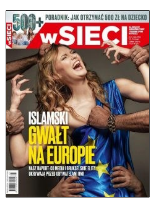
Figure 6.1. In February 2016, right-wing daily W Sieci, closely connected with PiS, published this magazine cover, portraying the "Islamic rape of Europe." The banner above the masthead promotes a guide to using the 500+ program, a recent PiS policy at the time.

With this rhetoric, PiS entered the 2015 presidential and parliamentary elections with a campaign strategy that emphasized returning Poland to a moral centre and strengthening its identity as a Catholic state in the face of "Islamization" from refugees and European elites. Compared to 2005, the party had shifted to a more openly Eurosceptic position, whereas although PiS still valued Poland's membership in the European Union, it