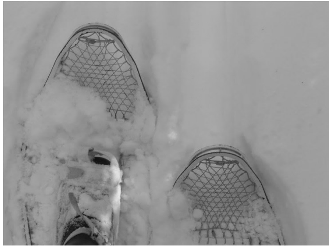
Figure 5 Snowshoes, photo courtesy of Frank Meuse

likewise, the beating of drums in shopping malls and the large round dances and marches by Indigenous Peoples with allies in protest against the destruction of Lands and waters across Turtle Island (and around the world), mark a struggle of the Idle No More Movement for the creation of spaces where the past and present came together with possibilities of a future rooted in mutual decolonization.