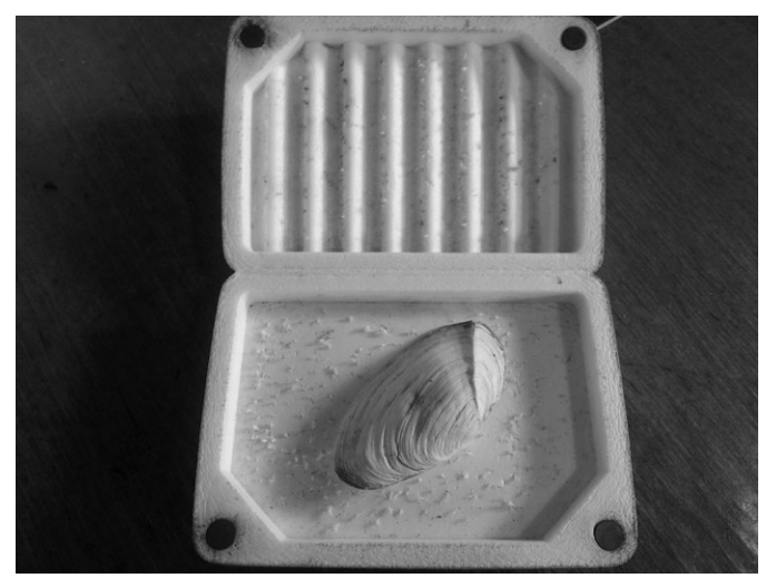
Figure 8 Clam-shell