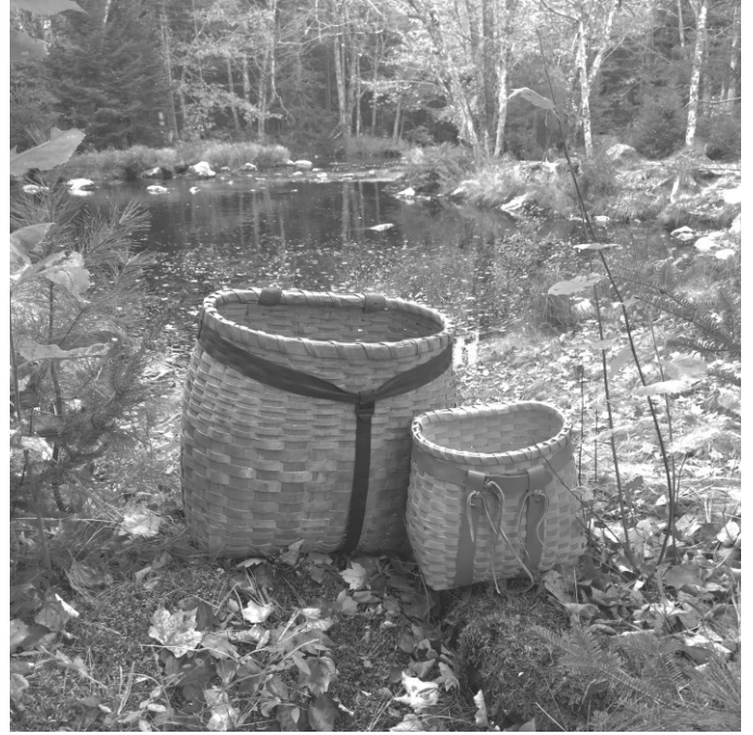
Figure 2 Pack Baskets, Sherry Pictou Collection