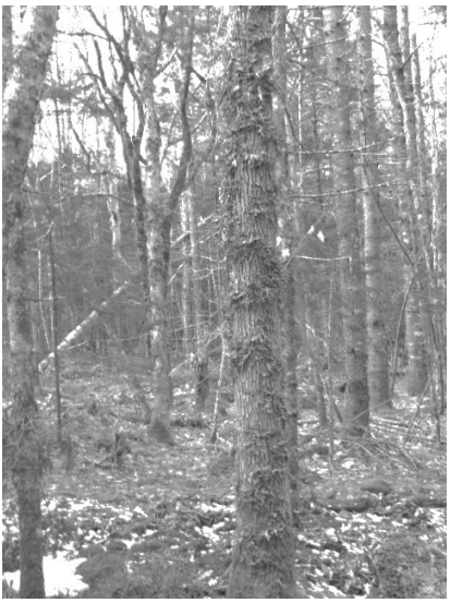
Figure 1 Ash tree

societies (Foley 1999; Choudry 2015). Therefore, Mi'kmaq basket weaving serves as a framework to conceptualize various strands of the research and to further learn how the research (tree) holds-taken-for-granted strands or relations (splints) and how they are interwoven (interrelated) together constituting the research journey (basket) as a whole.