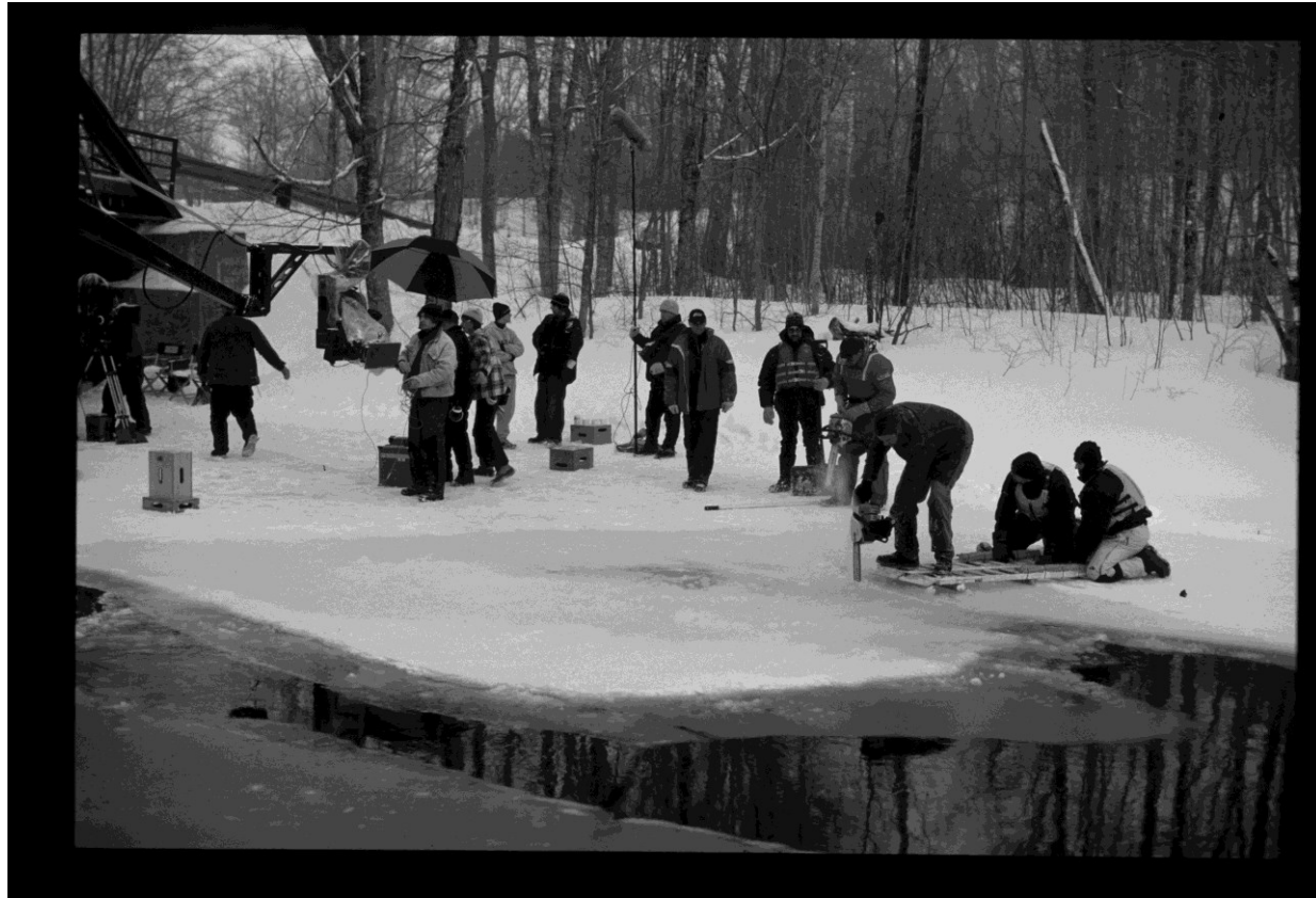
Production still from "The River King," imX Communications fonds (MS-3-40)