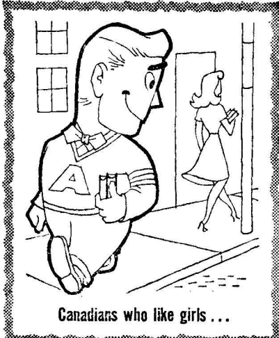
Canadians who like girls ...