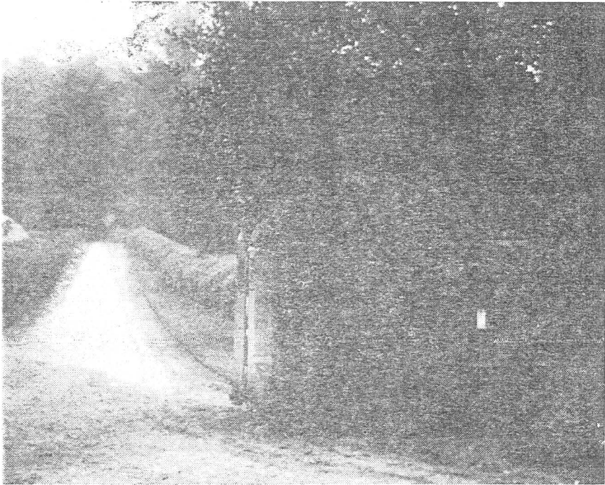
(A) The Road across the Flats leading to Moor Park

At the bottom of a hill, under the trees, after a decidedly long trek (far more, I think, than that mile the station guard