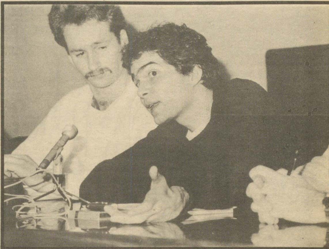
Would you take these guys seriously if they threatened to sue? That's what they were doing at a press conference Thursday — threatening to sue the university in event of a strike. Several hours later the faculty made the threat pointless by suddenly settling with the administration.

"When we went to a strike vote, the Board of Governors moved. When we had the one day strike, the Board of Governors moved," he says.