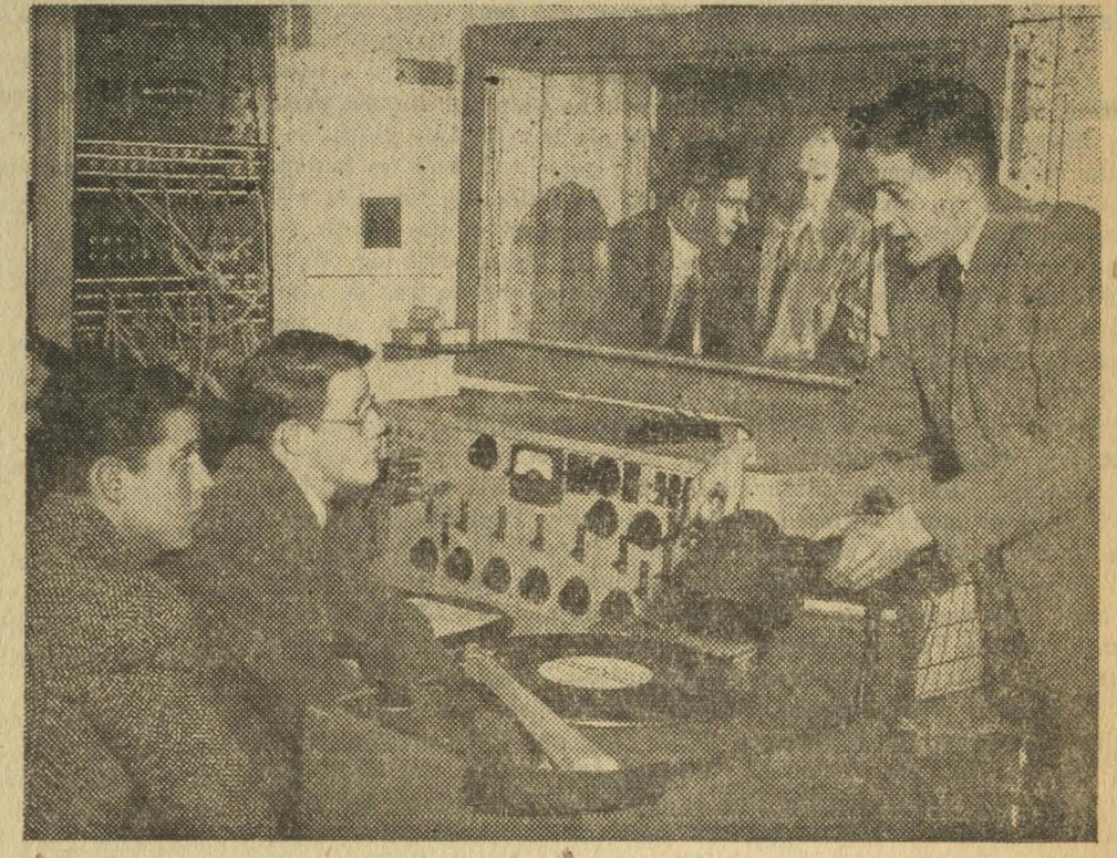
. . . Engineers