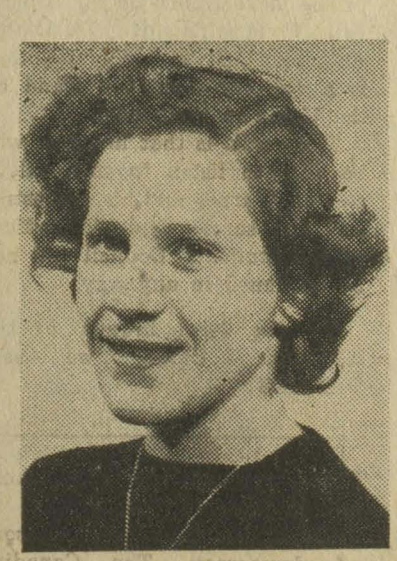
JEAN MITCHELL Pharmacy