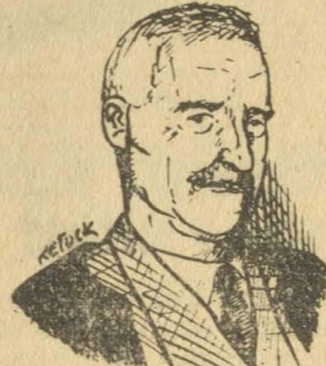
"(AHEM), YES-S-S, -THANK YOU.."