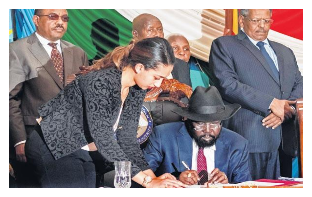
Figure 4: South Sudan's President Salva Kiir signs a peace agreement in the capital Juba, on August 26, 2015.

Upon presentation, some key planks of the draft agreement were vehemently rejected by the government of South Sudan, which termed them blatant infringement on South Sudan's sovereignty. The issues the government identified as contentious were later compiled and presented to the assembled dignitaries by President Kiir as a 12-page reservation document at the agreement signing ceremony in Juba. In his speech delivered at the signing ceremony, President Kiir's told his audience that the agreement he had just signed was an imposed agreement, revealing that he had received 'intimidating messages' without specifying the source (Copnall, 2016). In the same speech, Kiir stated that the agreement constituted a designed roadmap for regime change in South Sudan. While what was written in the reservations and said in the speech were overlooked because President Kiir had signed the agreement, those words clearly communicated what the government of South Sudan saw as an imposition upon the parties by