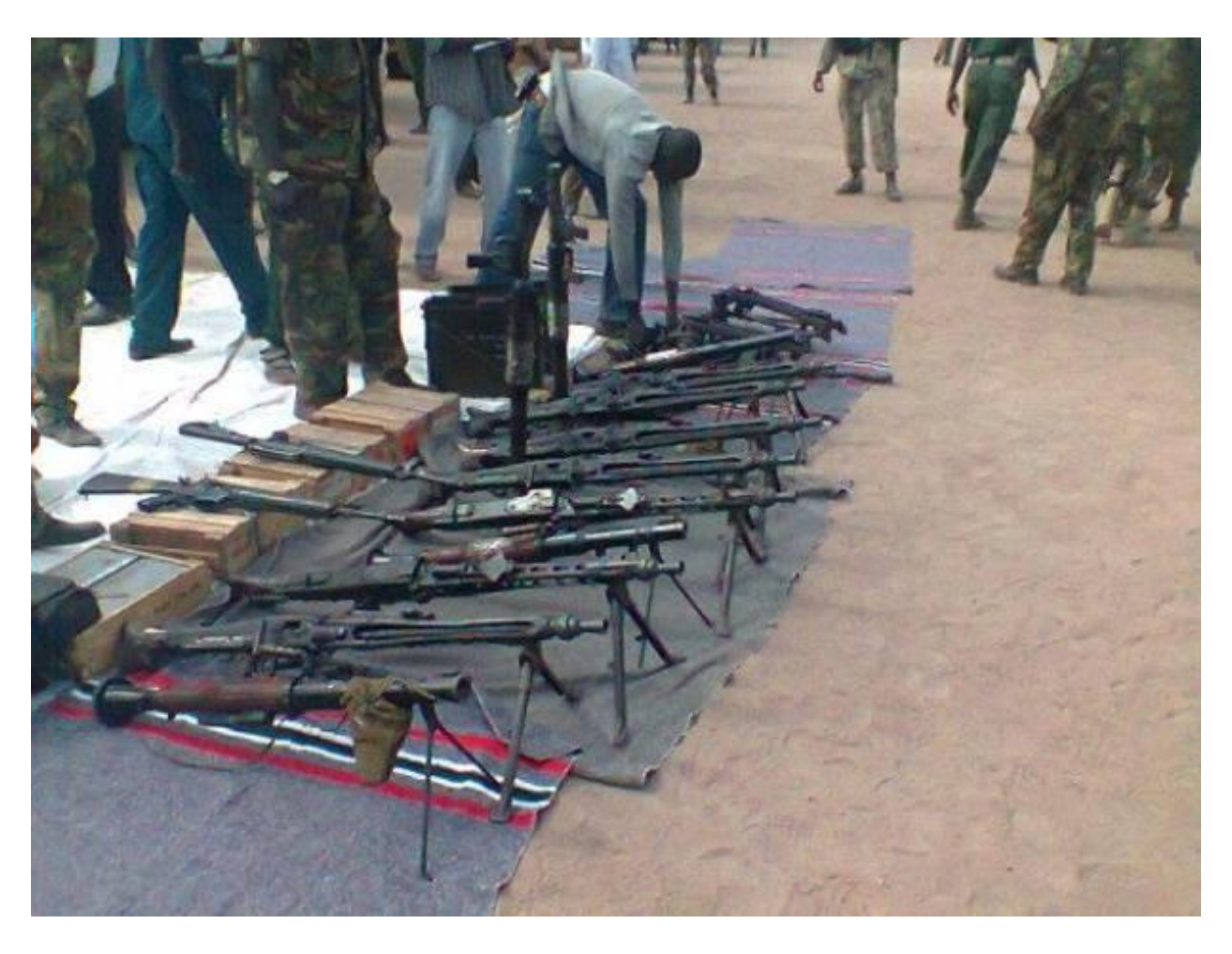
FIGURE 5: CACHE OF WEAPONS AND AMMUNITIONS SEIZED FROM UNMISS CONVOY IN RUMBEK

Another example, illustrating alleged UN bias towards armed opposition came in 2016 when a Small Arms Survey report revealed that UNMISS troops stationed in Bentiu handed back weapons collected from government troops who sought refuge in their compound to General James Koang Chuol, the self-declared rebel military governor of Unity State, on flimsy grounds that he was their interlocutor (Small Arms Survey, 2016, p. 15). The same report disclosed that when the UNMISS leadership in Juba tried to do the same (return weapons collected from rebel soldiers that sought refuge in their premises) the UN Headquarters in New York overruled them. Instead of remaining true to their initial policy of returning weapons collected from combatants who sought protection in their premises to the nearby authorities, either government or