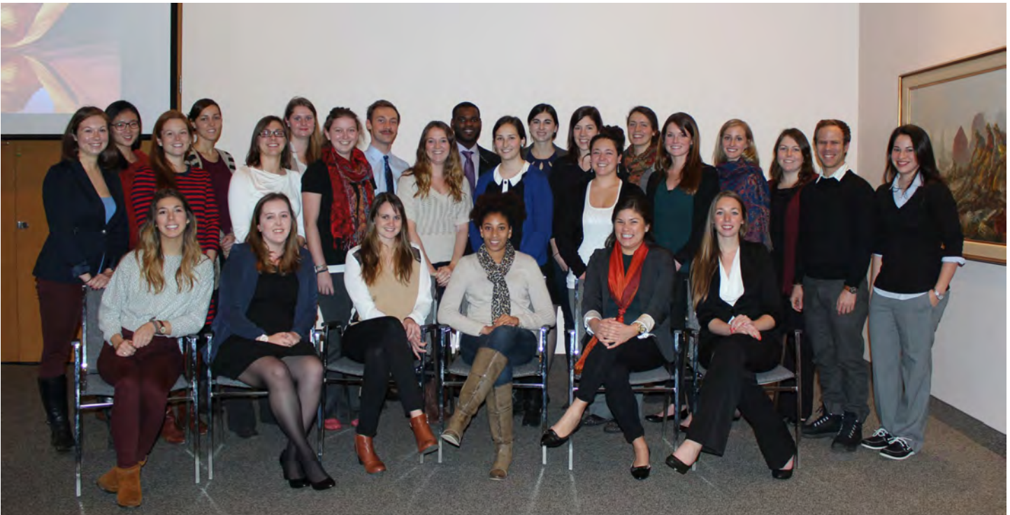
MMM Classes of 2014 and 2015 pose together at the Making Waves event