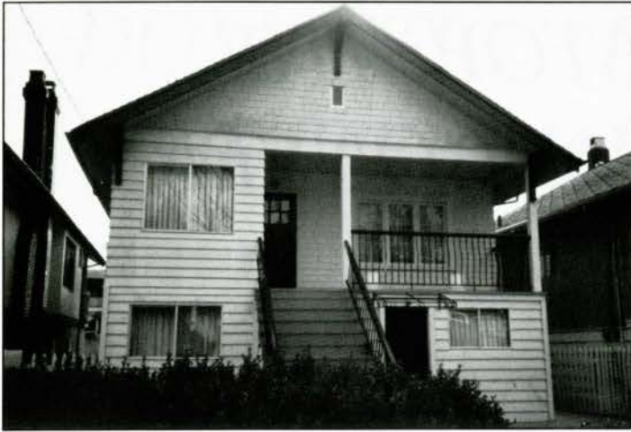
Figure 2 (left). 3478 West 6th Avenue, Vancouver, built as part of the Better Housing Scheme for $3,300 in 1920. This bungalow has been raised since its construction to make room for a basement suite, and the facade has been sided with vinyl. (J. Tyner, 1995)