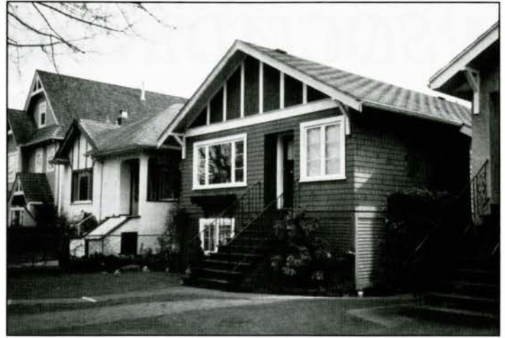
Figure 3 (right). 3250 West 6th Avenue, Vancouver, built as part of the Better Housing Scheme for $3,500 in 1919. (J. Tyner, 1995)

While the 153 homes constructed under the Vancouver scheme were not identical to the bungalow located on West 5th Avenue, there was an underlying pattern to them (figures 2, 3). Through their design, these bungalows evoked associations of sheltered domesticity, artistic sensibility, practical simplicity, efficiency, and craftsmanship.