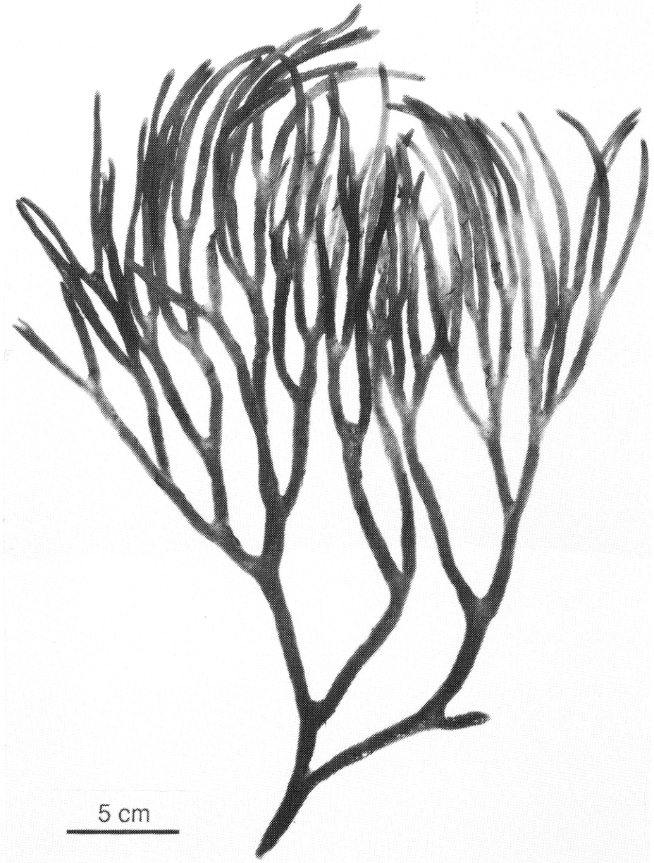
Fig 1. Codium fragile ssp. tomentosoides . Portion of a large plant. The spongy, repeatedly forked, cylindrical to compressed fronds are unmistakable in the seaweed flora of eastern Canada.