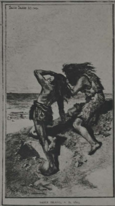
LaRoche's Colonists on Sable Island sighting the rescue ship, 1603