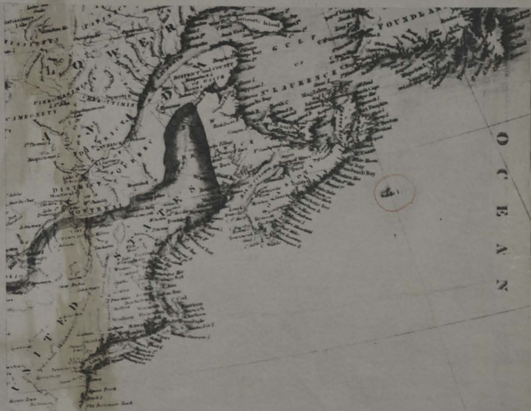
Map showing Sable Island where LaRoche landed his colonists, 1598