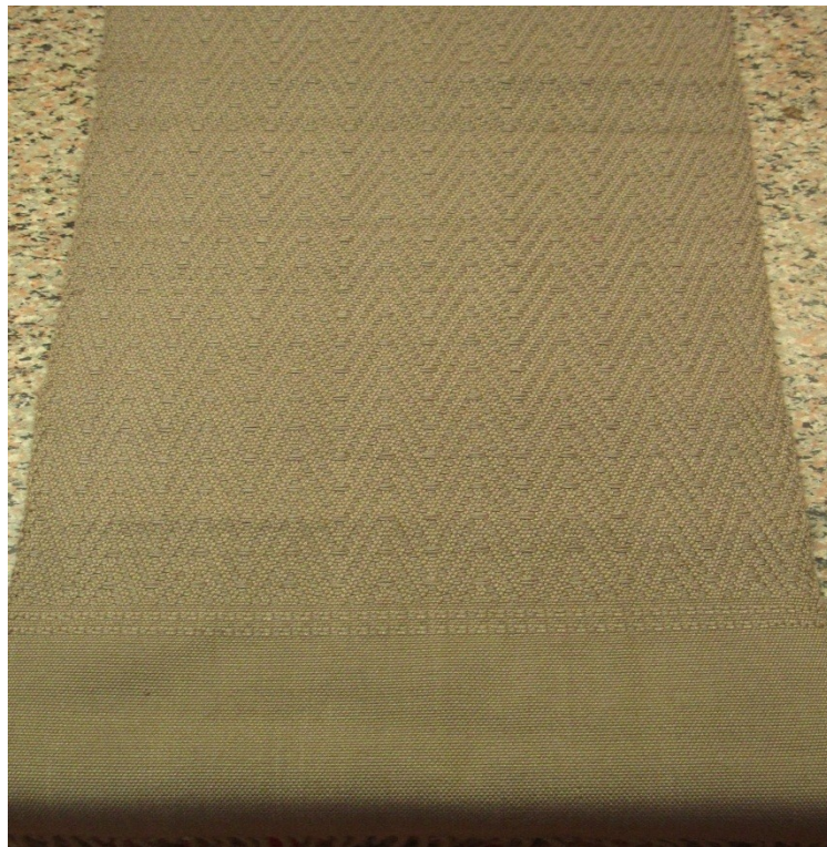
A scarf woven by Naw Day

This piece of fabric woven by Naw Day will be cut into 4 pieces and sewn into pillowcases. It took her 7 days of fulltime work to weave and was ordered by the income generation project.