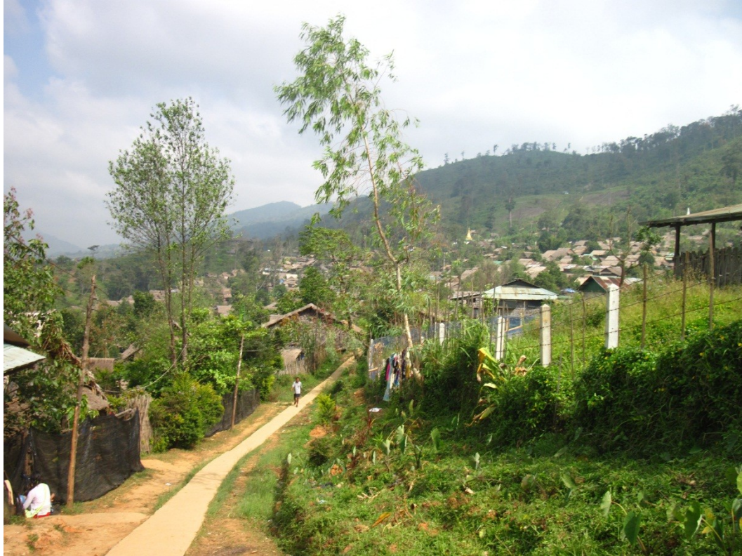
I took this photo of Umpiem Mai refugee camp and the following two photos on November 21, 2011

The camp is basically perched on treeless hills over a valley. You could see the whole camp because of the lack of trees. The infrastructure, houses, and schools seemed, in general, a lot more run down and in poorer condition. Again, like I felt in Ban Mai Nai Soi the first time, how can you put any thoughts, feelings and observations into words when your mind and body are in complete sensory overload? You have all the same scenes of dirty bumpy roads, dogs and chickens running around and children playing. But, the geographical location and the mix of people gave it a very different feel.