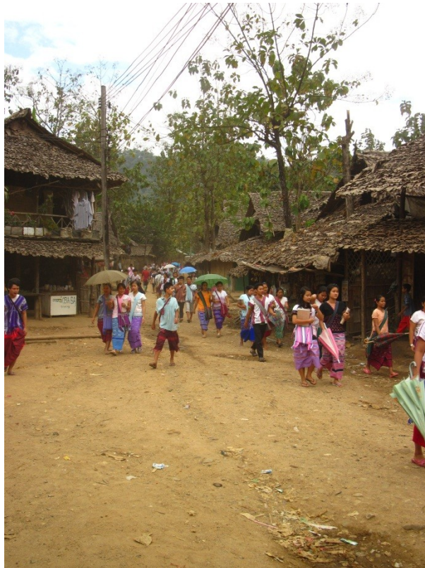
It happened to be “traditional clothes” day while I was in the camp. On this day students are required to wear their traditional clothes to school. I was told that on regular school days, students tend to wear more “western” clothes.