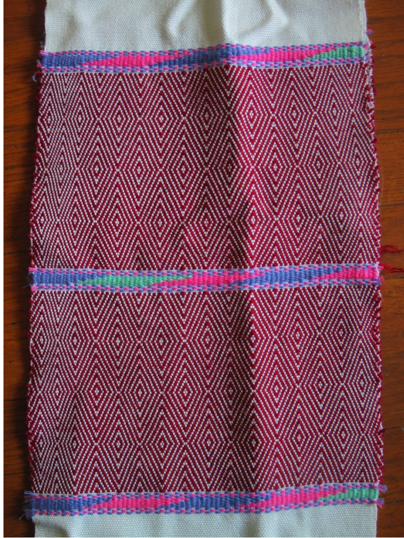
December Paw provided this example of the “snake” pattern that she wove on an unmarried woman’s traditional head dress or “hko peu”