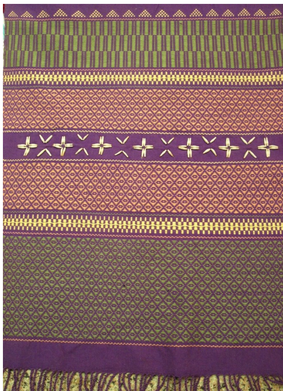
Naw Htoo Kay made this wall hanging to fill an order from the income generation group. The pattern was made as directed but she chose the colours herself. She indicated that she wasn't very happy with the result.