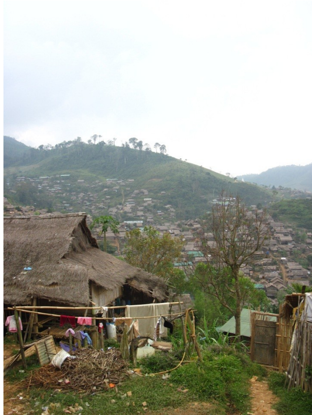
I took this photo of Umpiem Mai refugee camp during my visit there on November 21, 2011