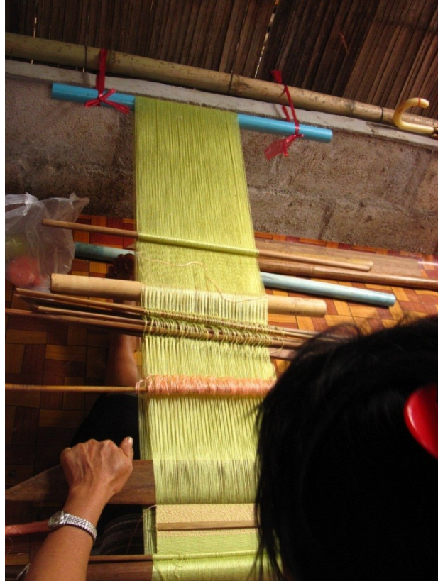
Naw Pay demonstrating how to weave a scarf