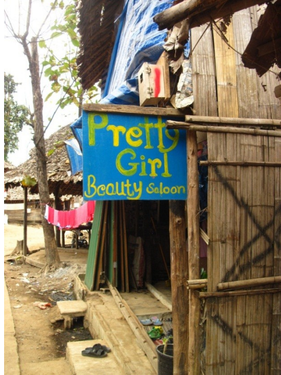
A local business in Mae La camp. I took these photos of Mae La during my visit on November 23, 2011