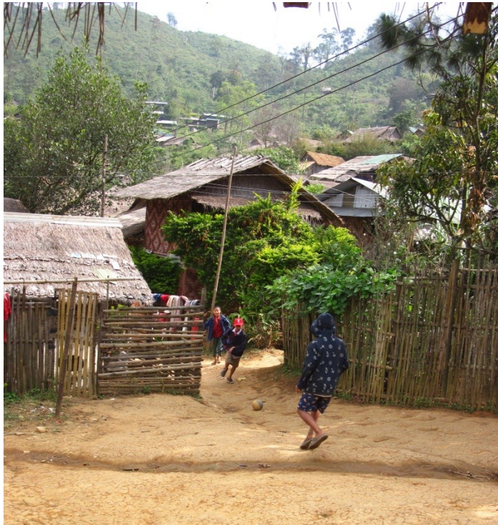
In my journal I wrote, "I loved seeing the kids playing soccer and just running around playing."