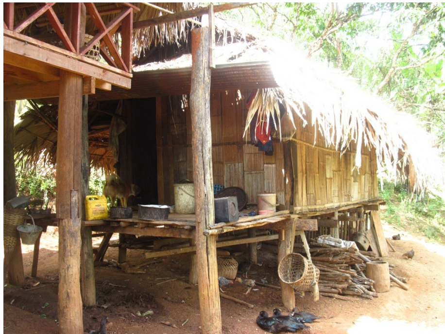
The house of the Karen family I had the opportunity to stay with on the Thai-Burma border. I have been told that this is a typical style of house for Karen people living in the mountain regions and would be similar to those found in Karen villages in Burma.