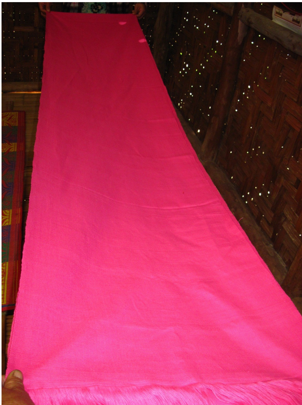
Naw Poe Pee wove this 10 foot piece of solid fabric to fill an order from the income generation program. A weaving this size takes Naw Poe Pee 4 days to complete and she will receive 110 Thai Baht ($3.62 Canadian) as payment.