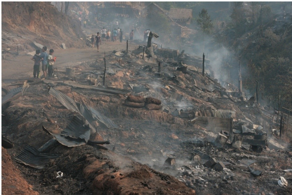
This is a photo of Umpiem Mai refugee camp after the fire on February 24, 2012