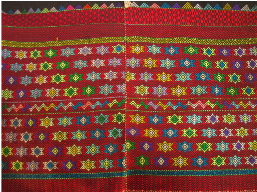
Paw Paw described the pattern as "stars"