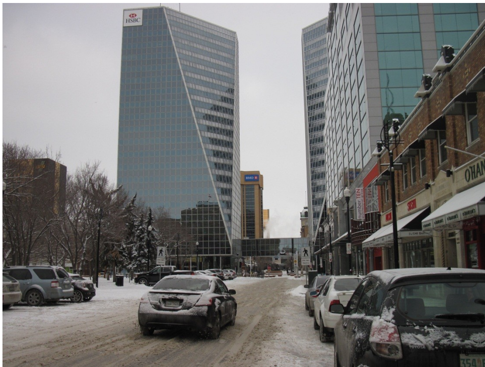
A picture of downtown Regina taken on March 2, 2012. For many of the Karen refugees in Regina, this is the first time they have ever lived in an urban setting.

comfortable life than paying rent individually would allow. Sharing a home means that at times there are up to 10 people living in the one small house. With health concerns and little education, my friend has told me there is not much she can do. She finds it difficult staying home during the day and would like other opportunities but she isn't sure what is available to her or how she could manage to do it. Despite these difficulties, she recently told me that although things are still hard for her, she is happy to be in Canada and is excited about the prospect of becoming a Canadian citizen, hoping her English is good enough to take the exam next year.