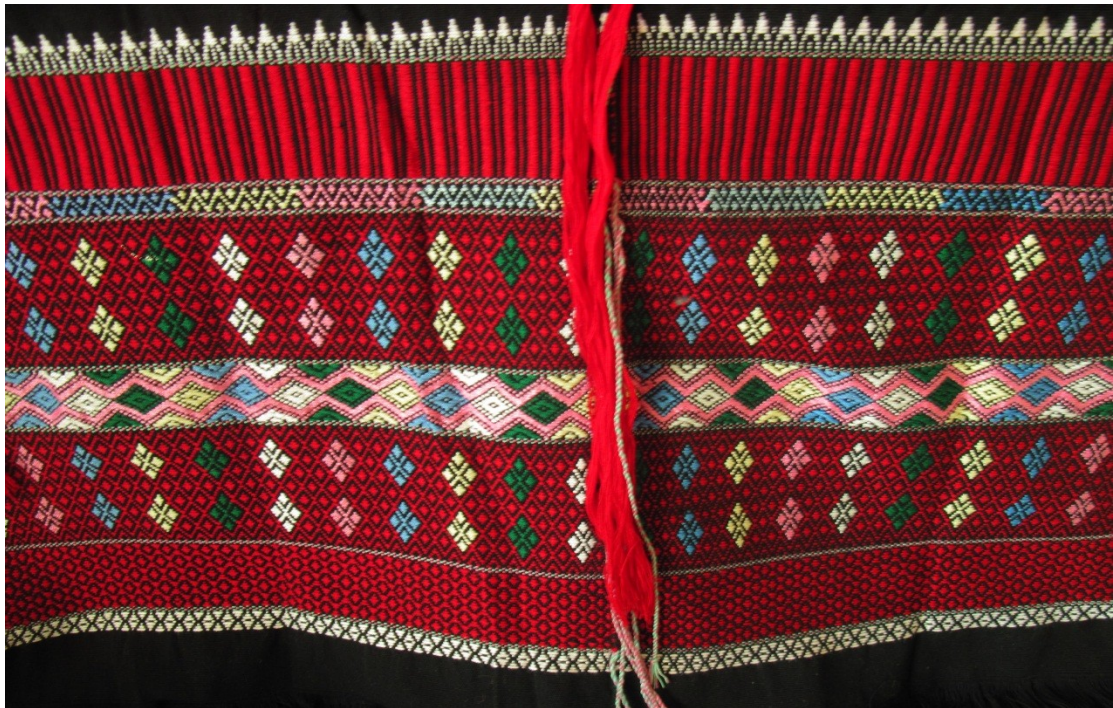
The pattern from a traditional married woman's shirt. Bway Bway made this in Thailand for herself.