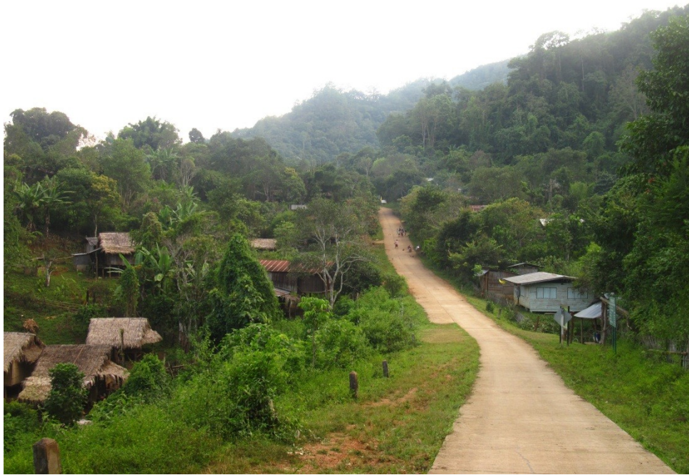
This is a Karen village in Thailand close to the Thai-Burma border. I had the opportunity to stay with a family in this village and took the photo on October 22, 2011.