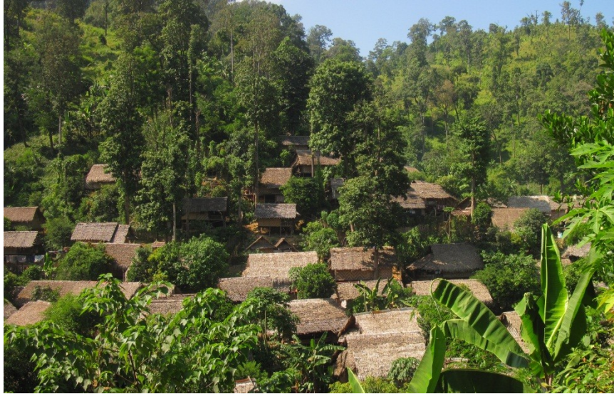
Above: houses in Ban Mai Nai Soi. Below: an elementary school & a house sitting precariously on the river's edge.

I took these following photos in Ban Mai Nai Soi on October 26, 2011.