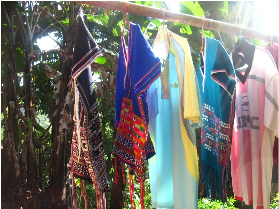
Karen women's shirts drying on a clothes line in Ban Hua Hee Karen village in Thailand.

A long time ago, there was a man and a woman who got married. At that time the women's clothing was pure black. After three days of being married, the husband left his wife. The woman was very sad so she went to get a tarot card reading. From the reading, she was told that her husband left her because her clothes were black. In order to have her husband stay, she needed to make her clothes colourful and sew flower patterns on to them. If she did this her husband would return and stay. That is why Karen women have bright colours and designs on their shirts, in the belief that it will keep their husbands from leaving them.