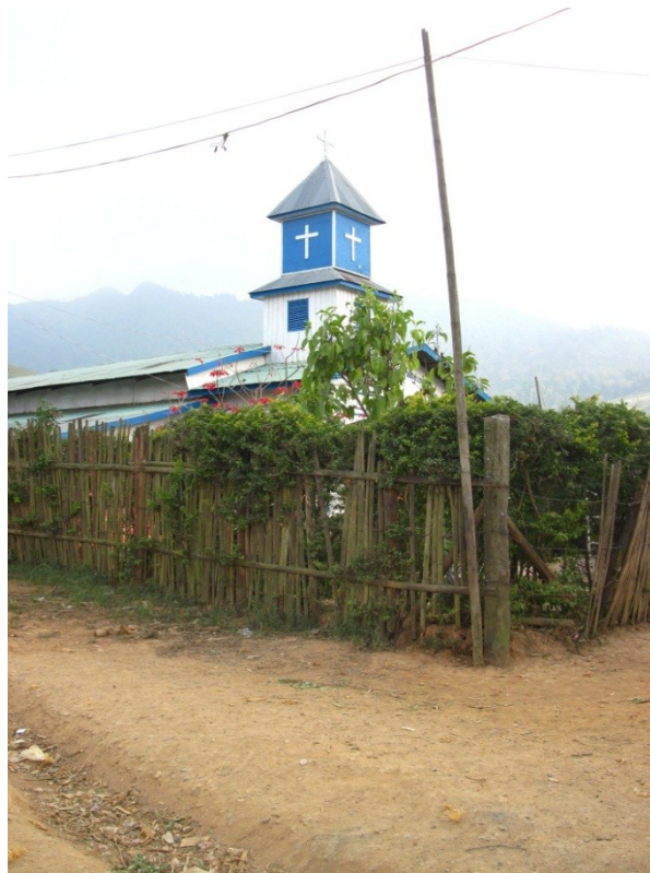
One of the many churches within the camp.