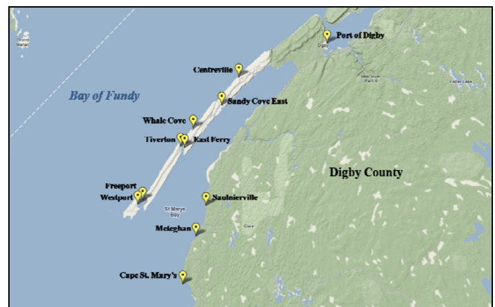
Figure 1. Digby County is home to ten of 187 fishing harbours in Nova Scotia, as well as the Port of Digby.

Despite the great economic, social and cultural significance of working waterfronts in Nova Scotia, there are a number of challenges associated with maintaining safe and efficient working waterfronts. A lack of funding and resources to operate and maintain wharves and other essential infrastructure has resulted in unsafe working conditions in many harbours. The Small Craft Harbours Branch (SCH) of Fisheries and Oceans Canada (DFO) is mandated to keep small craft harbours that are critical to the fishing industry open and in good repair. According to SCH, chronic rust-out at many small craft harbours means that 18% of SCH infrastructure is currently in poor to unsafe condition, with restricted user access at some harbours.