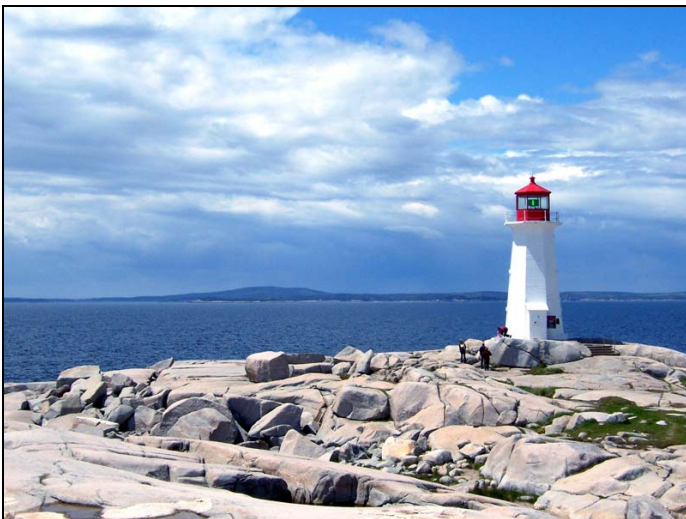
Figure 3. In addition to being a working waterfront, the fishing village and lighthouse at Peggy's Cove make it a popular tourist destination, attracting thousands of visitors each year.

A cooperative approach involving all levels of government is necessary for finding solutions to the problems facing working waterfronts. This call is supported by the wide diversity of stakeholders having an interest in this matter who fall under one level of authority or another. For example, the federal government has the primary responsibility for maintaining the majority of working waterfronts in Nova Scotia, while the municipal government has responsibility for land-use planning in the coastal zone. However, there are a number of actions which