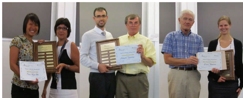
MAP prizes were presented at the end of the Making Waves event. The awarding of the prizes was established in 2009 to recognize MMM student achievement. The recipients were (l to r):