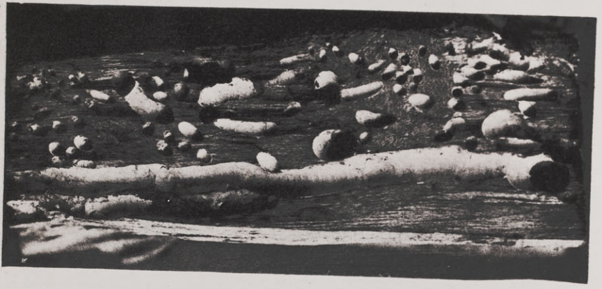
Fig. 14.—Spruce submerged two years in Coal Mining Company's wharf, Middle River, Pictou, N. S., four feet below low water.