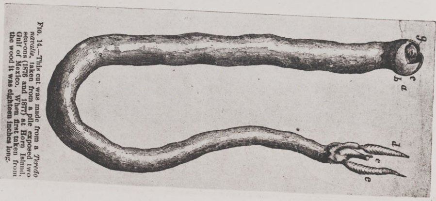
Fig. 14.—This cut was made from a Teredo navalis , taken from a pile exposed two seasons (1876 and 1877) at Horn Island, Gulf of Mexico. When first taken from the wood it was eighteen inches long.