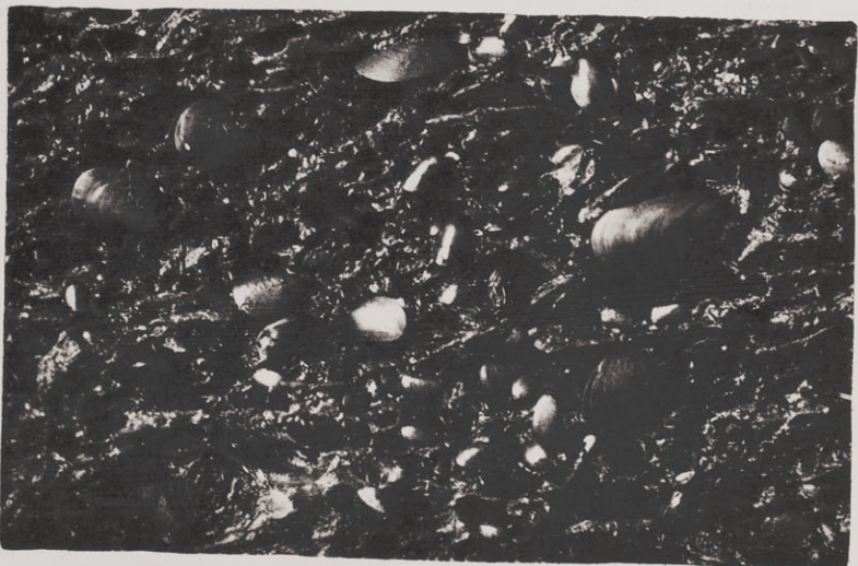
Fig. 16.—Photograph of piece of spruce pile from Halifax Harbor, N. S., containing living Limnorhynchus lignorum and mussels.