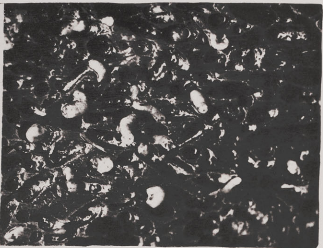
Fig. 15.—Hemlock from Yacht Club wharf, Halifax Harbor, N. S., attacked by Limnorhynchus lignorum . Enlarged 4 diameters.