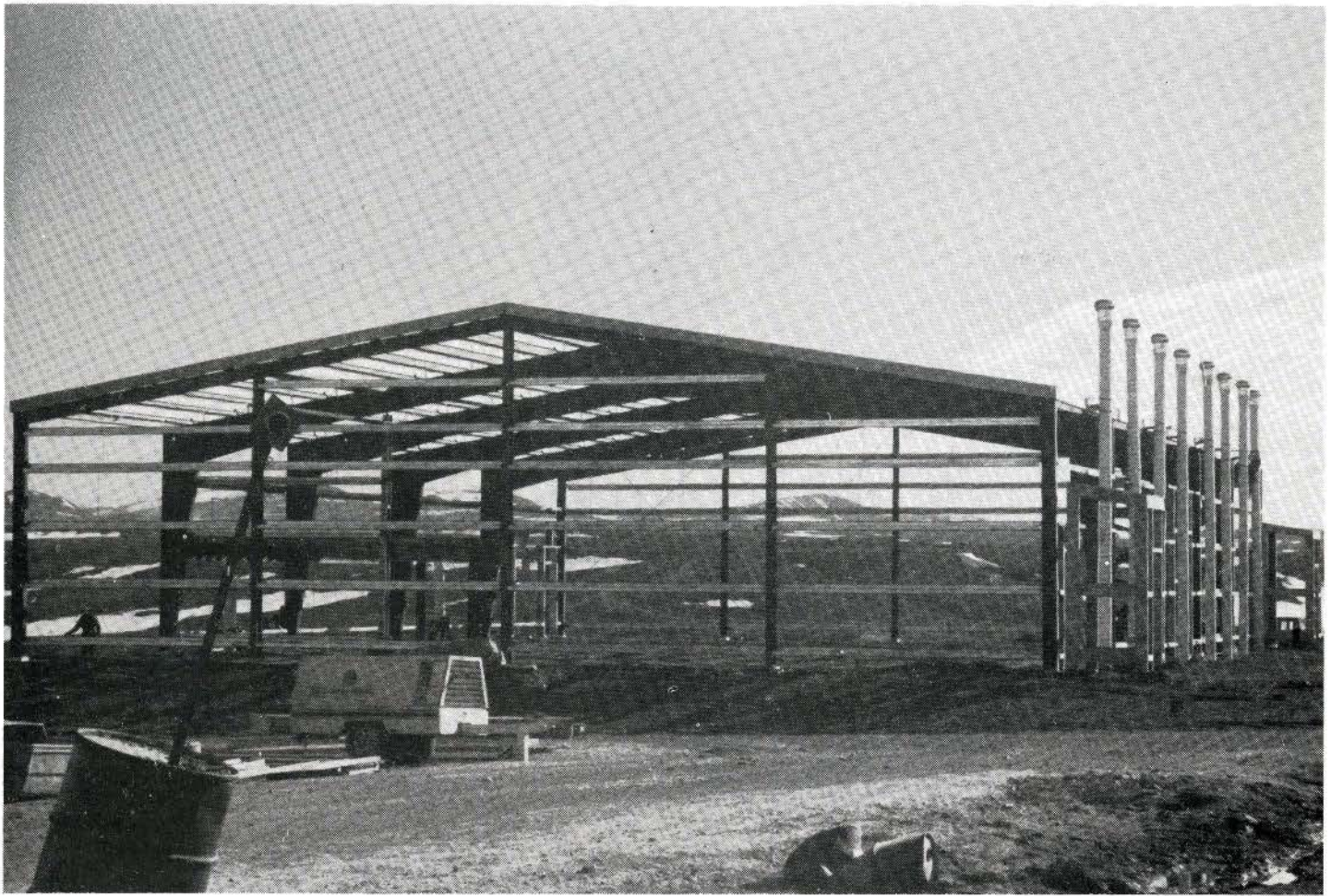
Supply warehouse under construction at CFS Alert, N.W.T.

Lake, Inuvik, Resolute Bay and Alert. During the postwar period the CMUs were slowly disbanded. Eventually 1 CEU was created in 1962, from the remaining components and the work continued throughout the North.