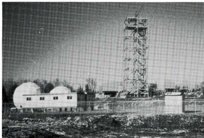
Short Range Radar Prototype under construction at North Bay, Ontario.

The work over the last 15 years at Alert has resulted in the reconstruction of a large portion of the station at a cost in excess of $30 million. These costs do not include the equipment, fuel and transportation costs associated with moving 700 tons of construction material each year. The work has been done almost completely by military tradesmen. The scope of this project and the limited military engineer manpower in the Canadian Forces has resulted in most engineer tradesmen having spent two months or more in Alert. □