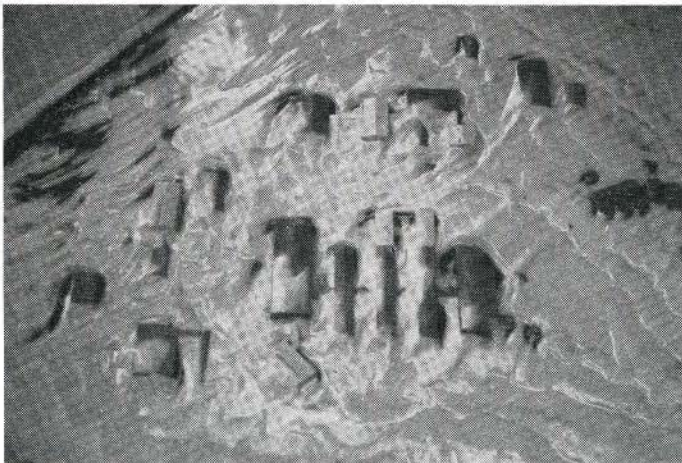
Snow model testing for CFS Alert.

The reconstruction of the world's northernmost permanently manned settlement—Alert, on the northern tip of Ellesmere Island has been