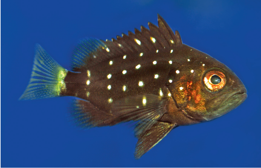
Fig 2. A juvenile Snowy Grouper, Epinephelus niveatus , captured on an artificial reef near Halifax, NS, Canada 2.5 cm total length