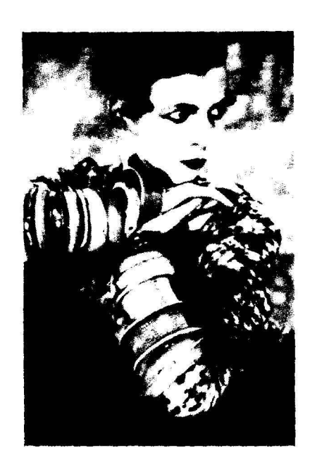
FIG. 2. Photograph of Nancy Cunard by Man Ray, 1927.