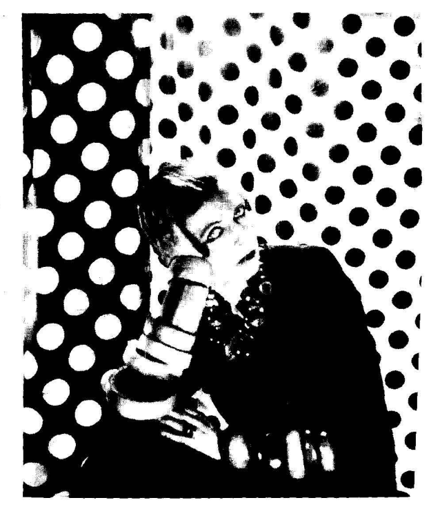
FIG. 3. Photograph of Nancy Cunard by Cecil Beaton, 1930.