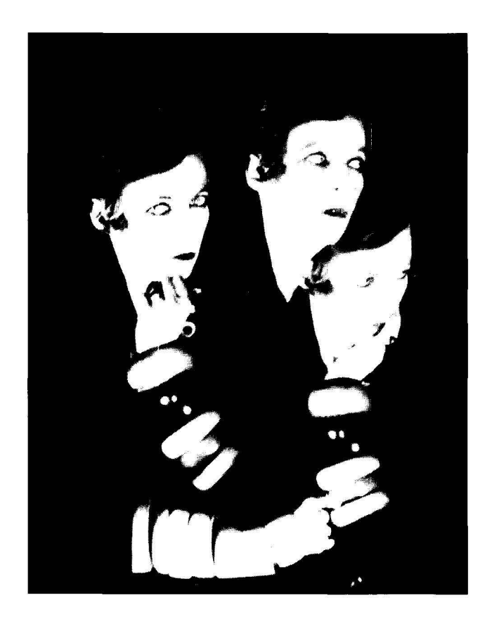
FIG. 4. Photograph of Nancy Cunard by Cecil Beaton.