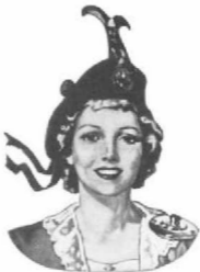
THE MACDONALD LASSIE