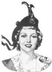
THE MACDONALD LASSIE